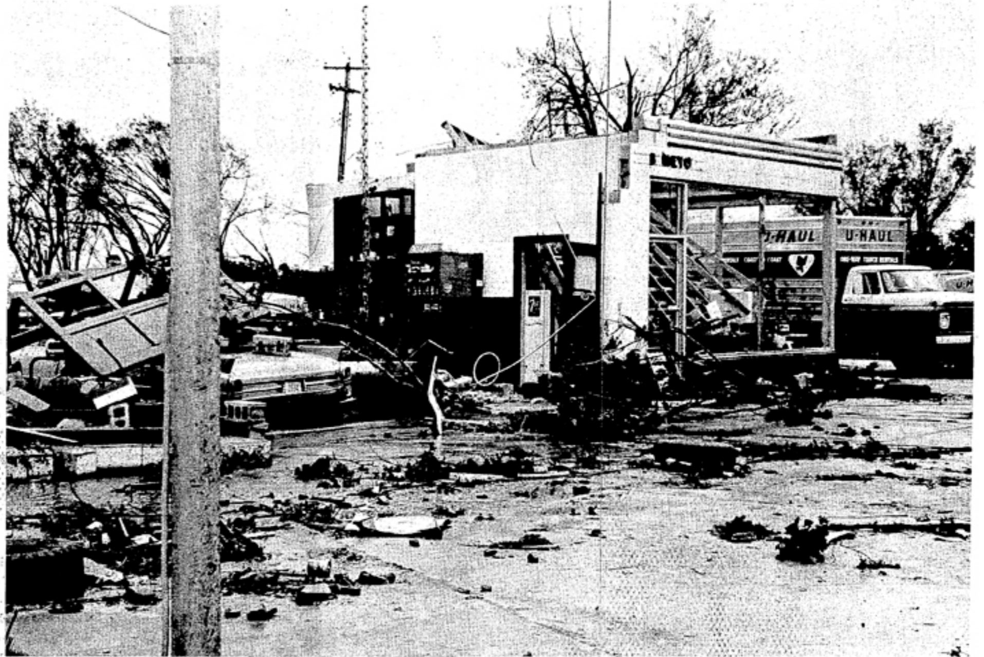
ONE OF OELWEIN'S business establishments leveled in the storm was Barney's Texaco at the north edge of the city. Fred's Super Valu, Sperry's Garage, and the Book & Art were also heavily damaged in the immediate area.

Terry's Gulf, Sun Mart, Oelwein Bottling Works, Whittig's Flowers, Farm Fleet, Acme Trucking, Kinsman Greenhouse, Warthan Motors, Pine Lodge, Oelwein Veterinary Clinic, Valley Mobile Homes, Hub City Implement, Oelwein Furniture, Apco Station, Northwest Distributing, Oelwein Elevator, Rogge's Machine Shop, Grand Hotel, Lambert Chevrolet, Oelwein Implement, Wiley Davis Insurance and Oelwein Glass and Paint.