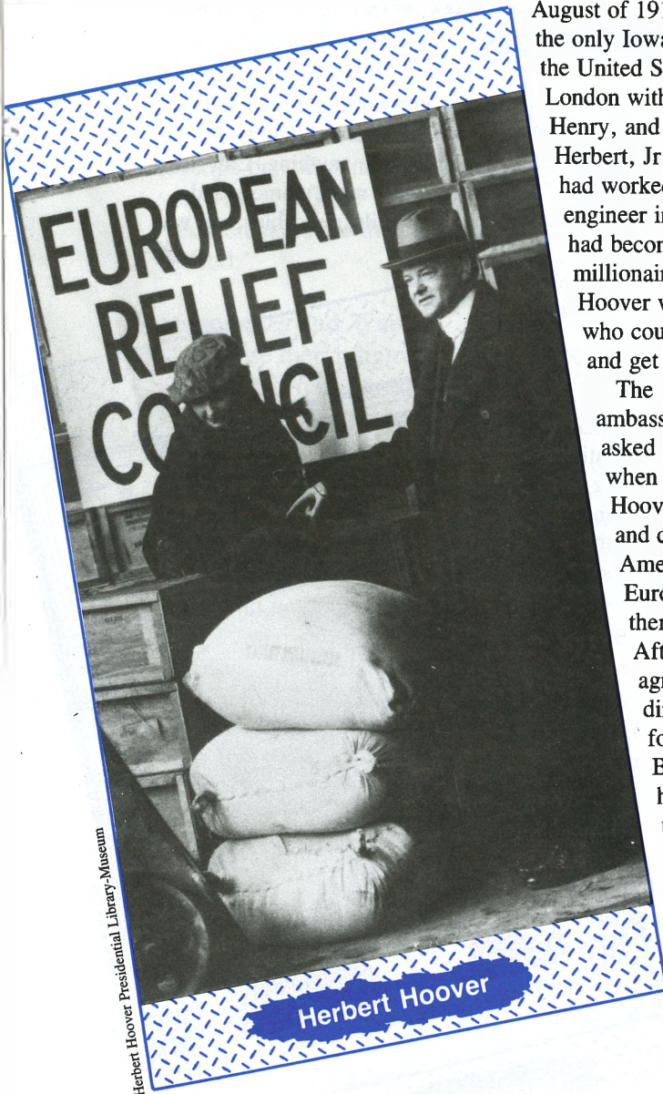
Herbert Hoover Presidential Library-Museum

When the United States entered the war, President Woodrow Wilson asked Hoover to organize an American campaign to save food to feed both soldiers and starving people. Americans began to proclaim that "Food Will Win the War," and agreed to eat foods as unusual as whale steaks and parsnip cutlets. Children gave up candy, and began chewing sugarless gum. Mondays became "Meatless Mondays," so people didn't eat meat. Wednesdays became "Wheatless Wednesdays," so people didn't eat bread. Making do without one food group or another one day a week was not a great sacrifice, but it made a difference to the war effort.