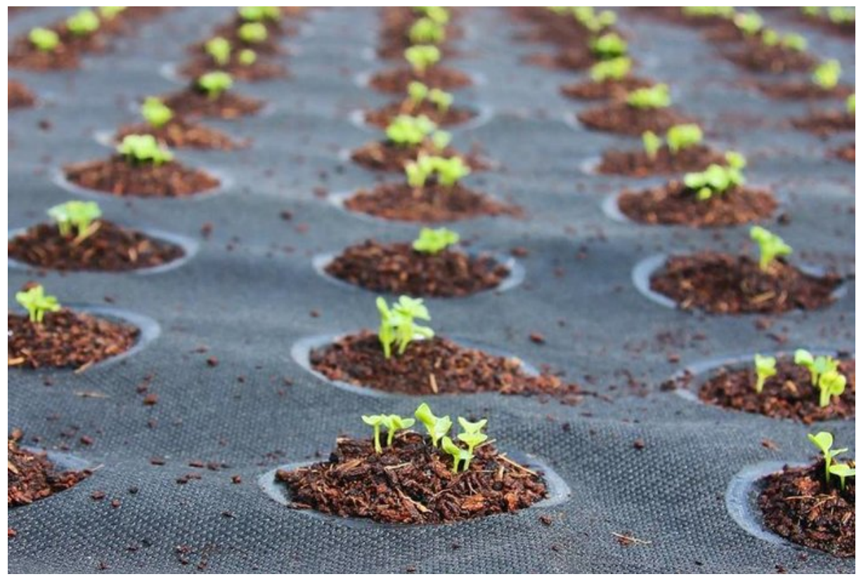
Seedsheets are made of weed-blocking fabric, a thick layer of soil and dissolvable pods full of organic seeds.