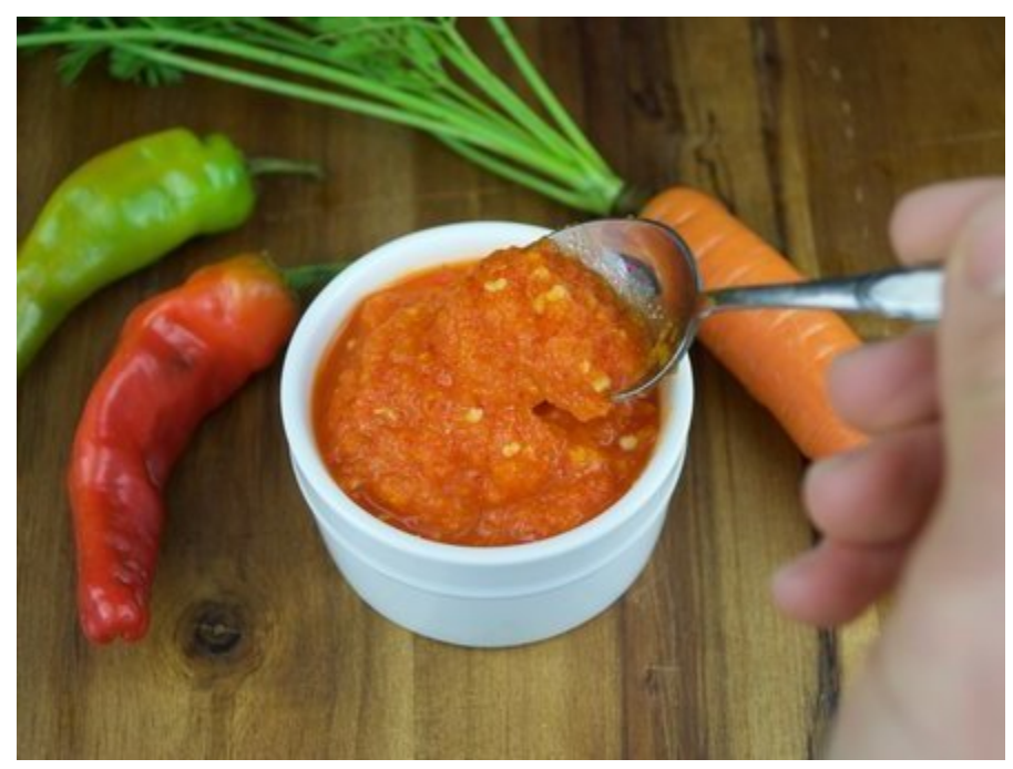
Seedsheets are recipe-focused. For example, the one for hot sauce includes seeds for cayenne peppers, red carrots, Napoli carrot and purple bunching onions.

MacKugler and his team focus on fast-growing varietals like Glacier tomatoes, while Ruby Streaks mustard greens and Valentine's Day radishes can be ready to eat in about a month.