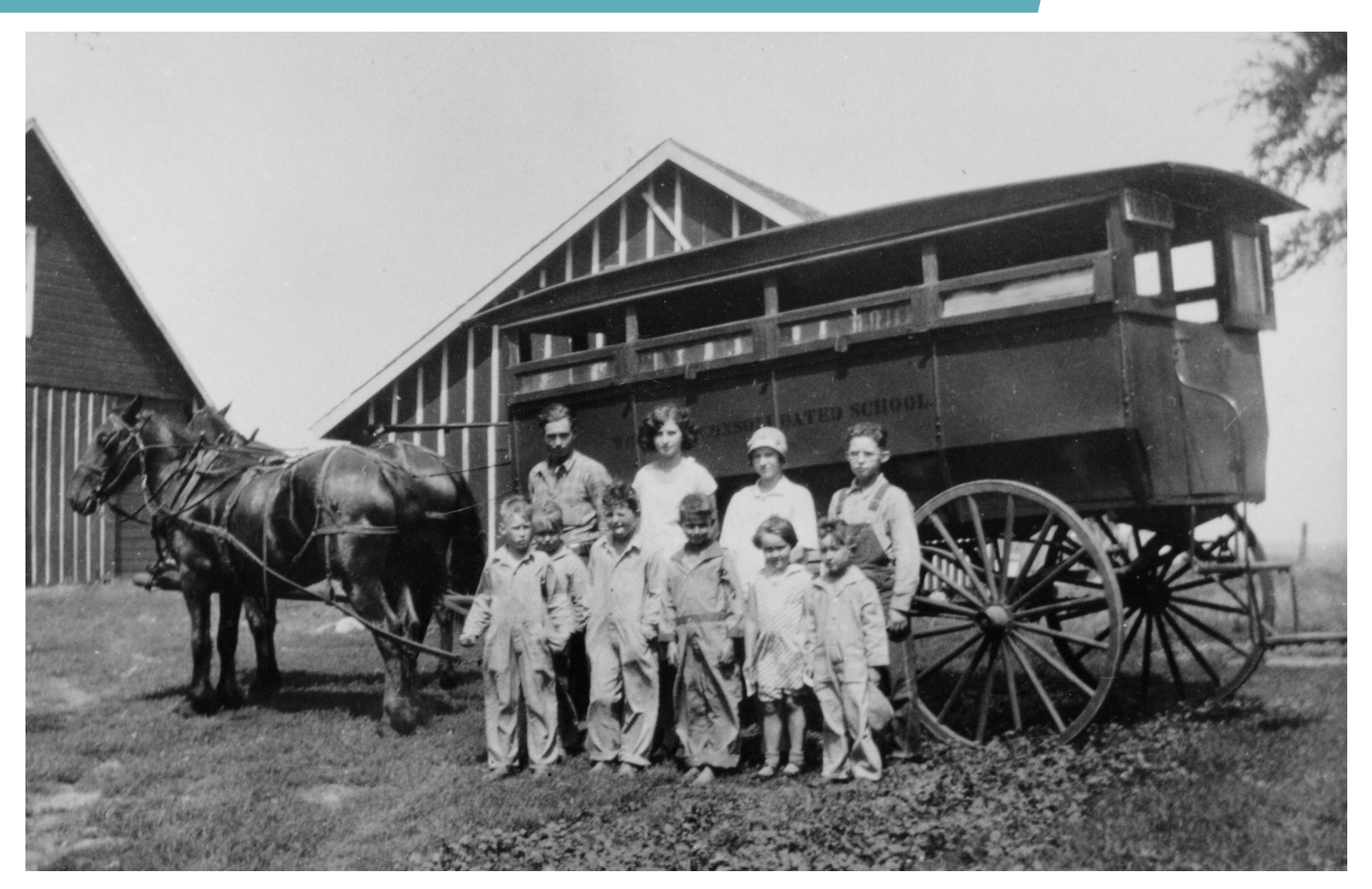
This photograph shows children standing beside a horse-drawn bus for the Webster Consolidated School in Keokuk County, Iowa. 1928