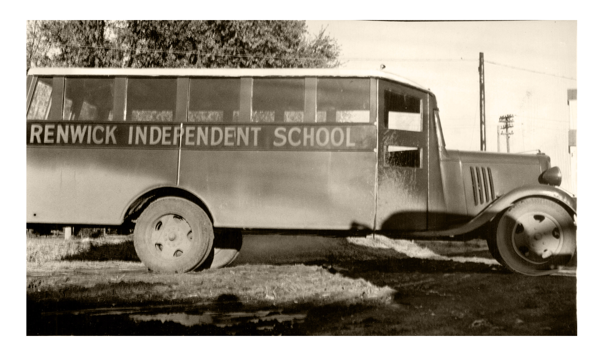
The photograph features a wooden bus of the Renwick Independent School in Renwick, Iowa. The photo was taken in October 1937. Courtesy of the State Historical Society of Iowa, Des Moines Register & Tribune, October 1937