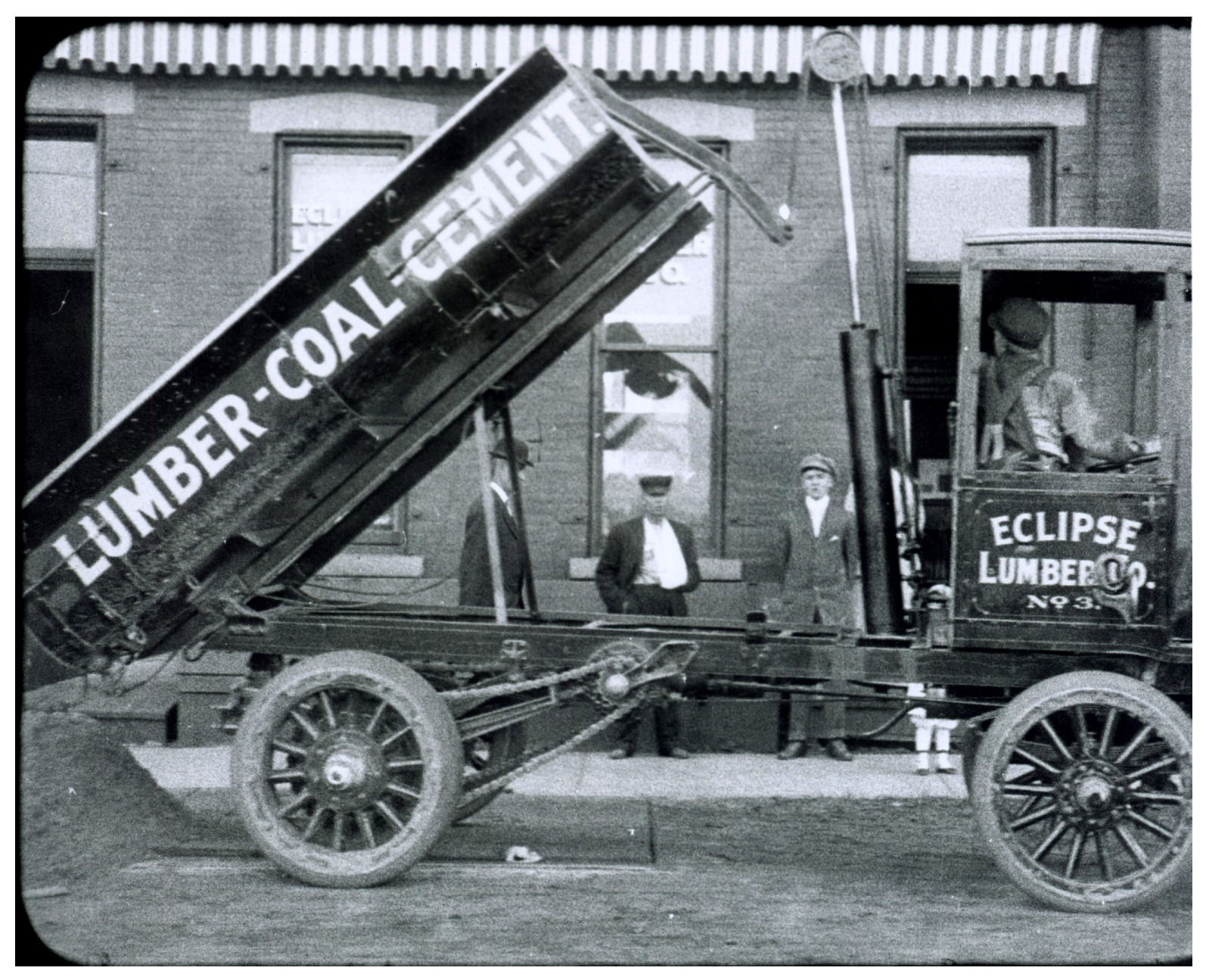
This photograph shows a dump truck of the Eclipse Lumber Company in Clinton, Iowa, in 1913. Courtesy of the State Historical Society of Iowa, 1913