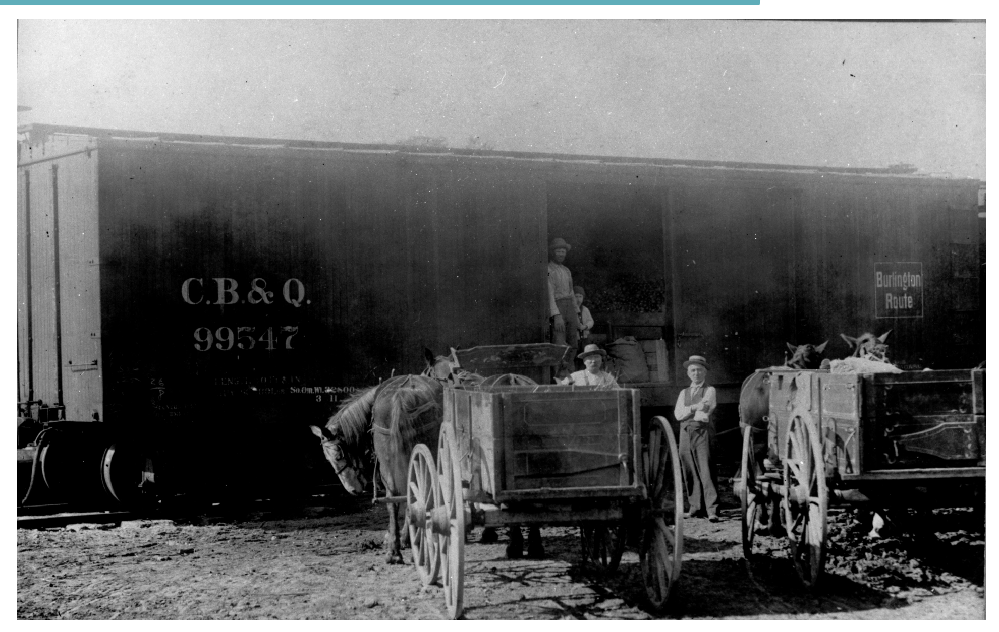
Residents are shown standing beside wagons in the process of loading potatoes onto a Chicago, Burlington & Quincy railcar. Courtesy of the State Historical Society of lowa, 1903