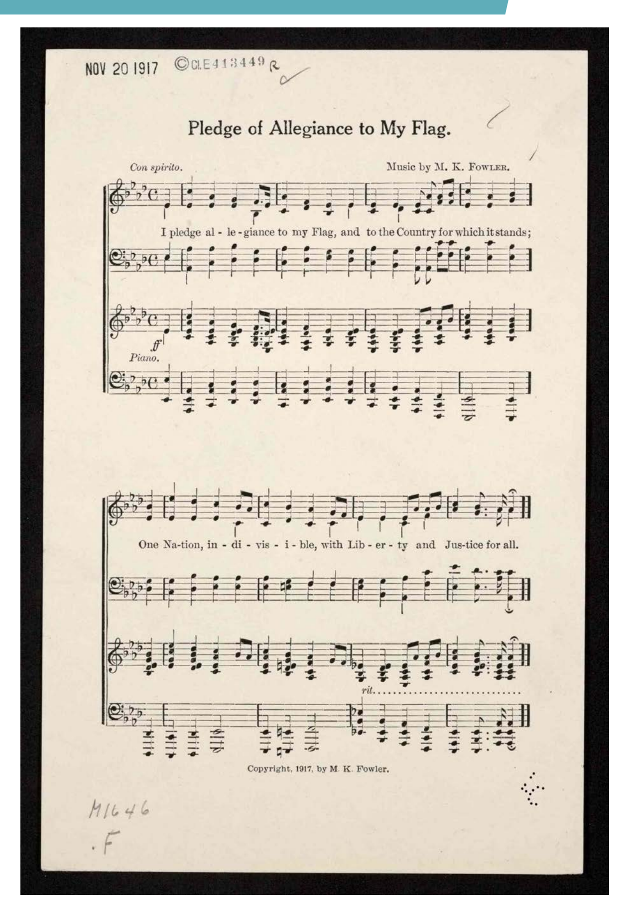
This is a songsheet for the "Pledge of Allegiance to My Flag." Courtesy of Library of Congress, Fowler, M.K., "Pledge of Allegiance to My Flag," 20 November 1917