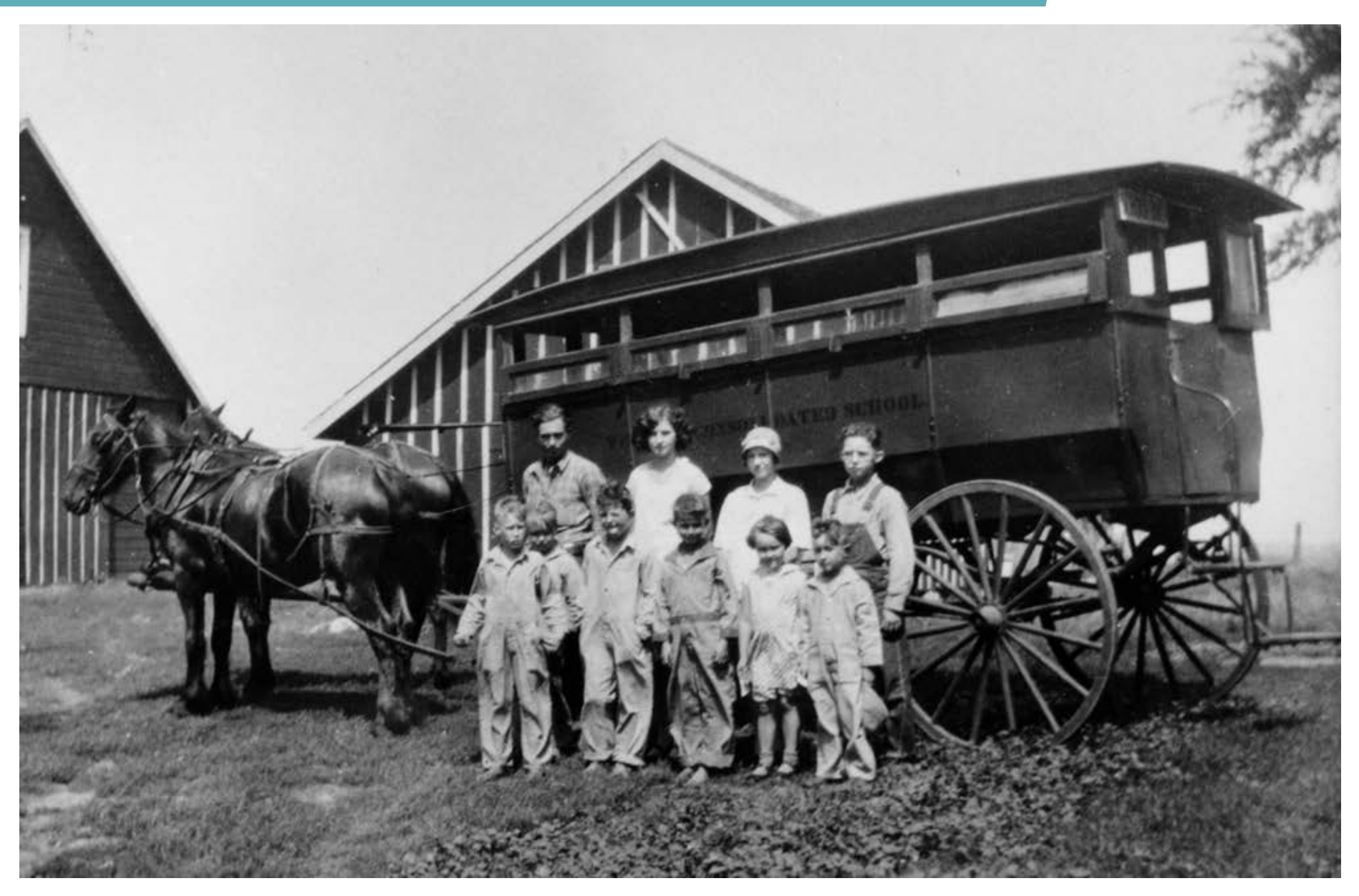
The photograph shows children from Webster Consolidated School standing beside a horse-drawn bus. The image was taken in 1928 in Keokuk County, lowa. Courtesy of State Historical Society of lowa, 1928