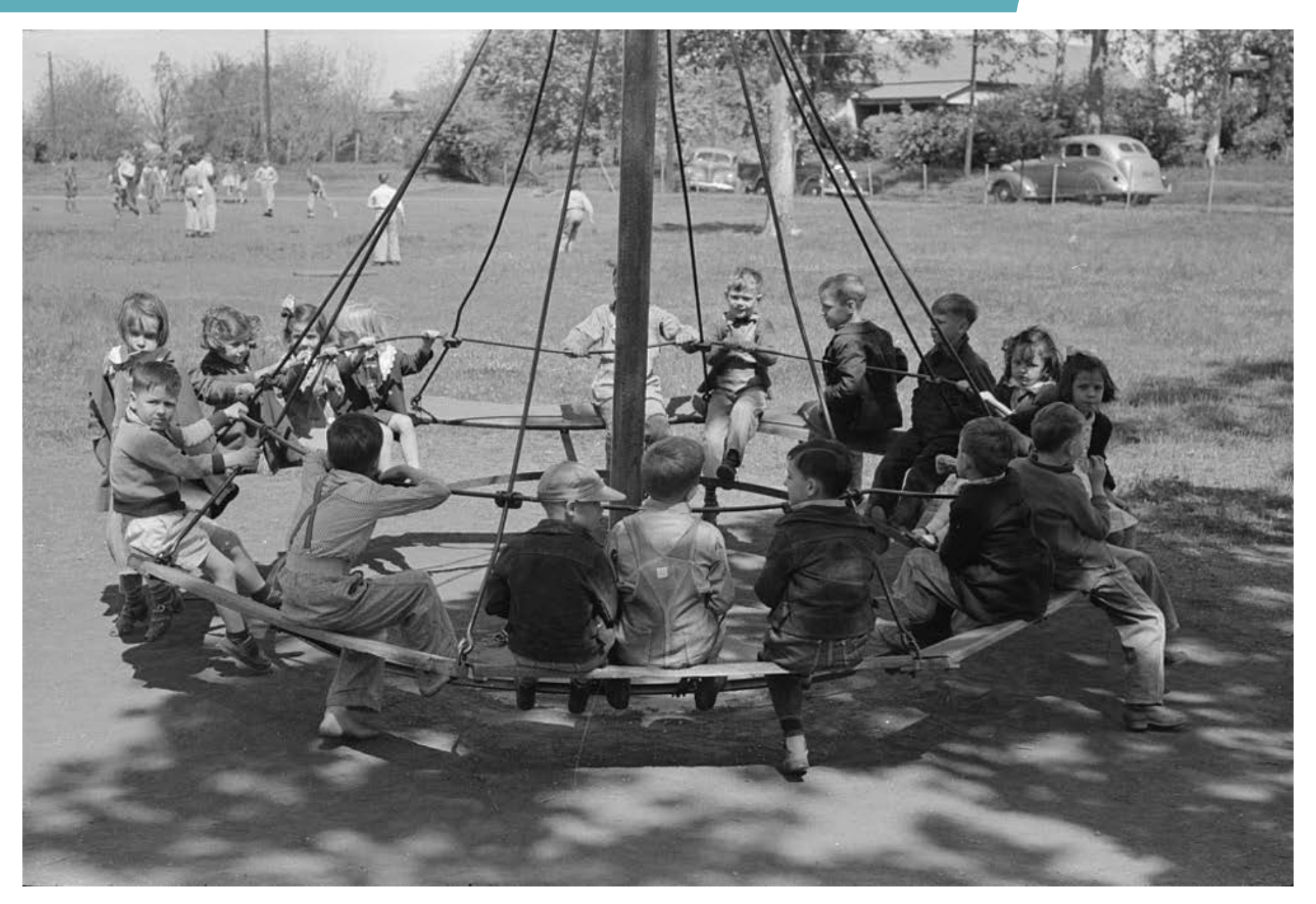
This photograph shows schoolchildren on a circular swing in San Augustine, Texas. The image was taken by Russell Lee in 1939. Courtesy of Library of Congress, Lee, Russell, "Schoolchildren on circular swing, San Augustine, Texas," April 1939