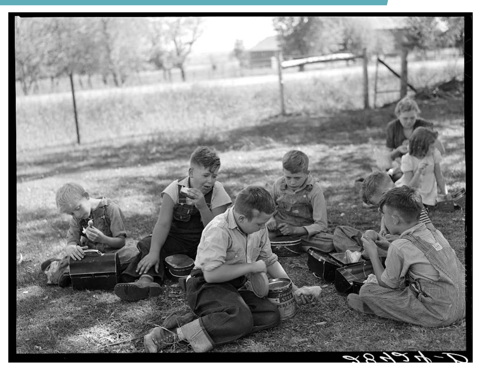
The image shows a group of young students having their lunch outside at a country school in Grundy Center, lowa. The photo was taken by Arthur Rothstein in 1939. Courtesy of Library of Congress, Rothstein, Arthur, "Lunch hour at country school. Grundy County, lowa," October 1939