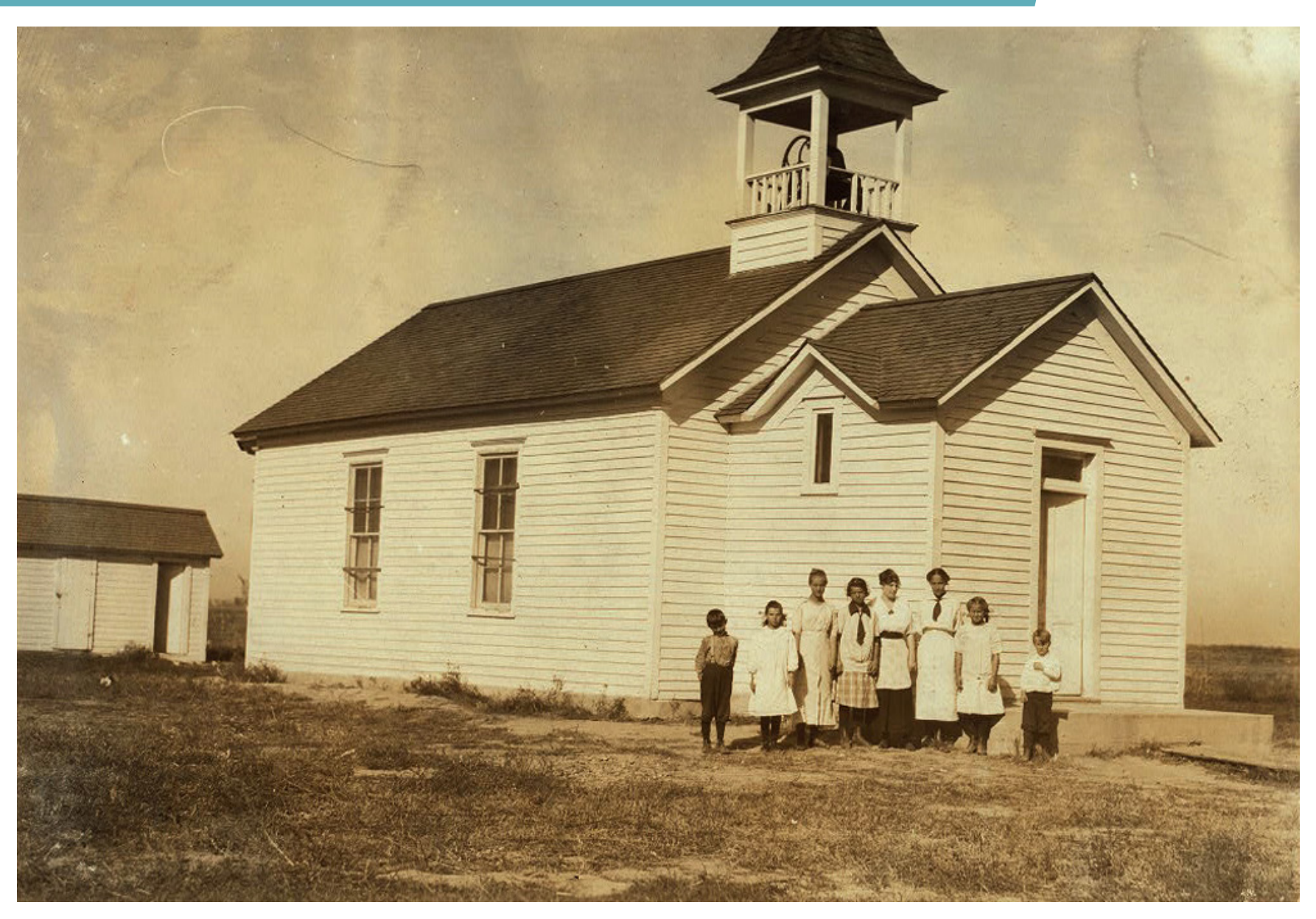
This photograph of a one-room schoolhouse in Brush, Colorado, shows seven children and a teacher outside. Named the Williams School, the image shows a small portion of the expected 30 to 40 students expected when beet work in the fields was over. This photo was taken seven week after school opened.