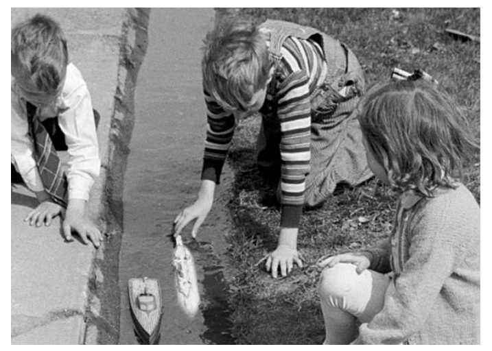
Courtesy of Library of Congress, Vachon, John, "Children playing with boats, Grundy Center, Iowa," April 1940

The formative assessments, lesson summative assessment and possible scoring options allow you to evaluate how students comprehend and apply the knowledge they learned from the individual primary source activities. Assessment instructions, example