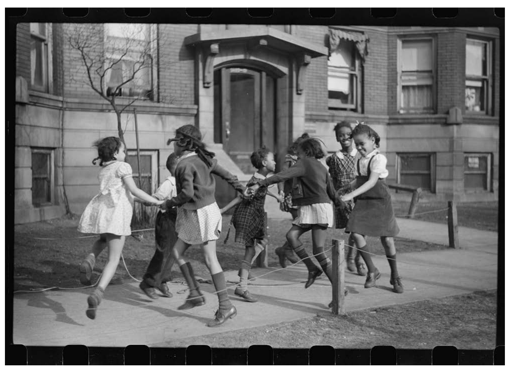
Courtesy of Library of Congress, Rosskam, Edwin, "Children playing 'ring around a rosie' in one of the better neighborhoods of the Black Belt, Chicago, Illinois," April 1941