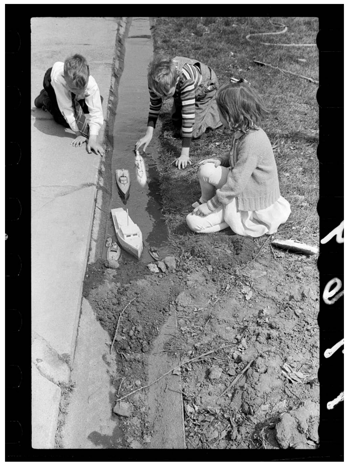
"Children playing with boats, Grundy Center, Iowa," April 1940