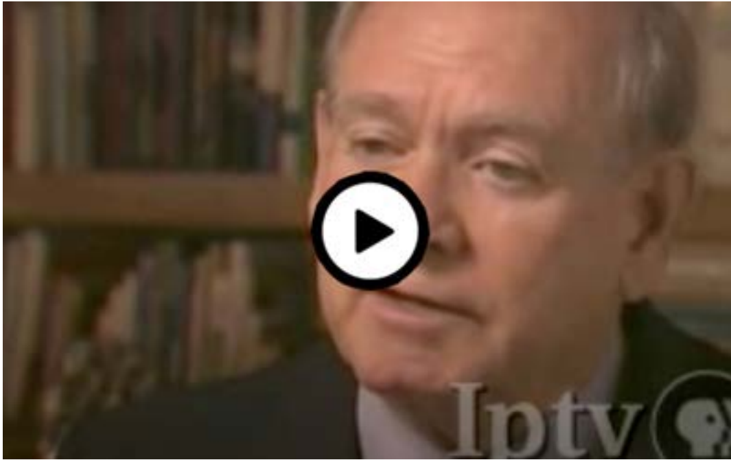
Governor Robert Ray Talks about “The Right Thing To Do” from Iowa PBS, 2007