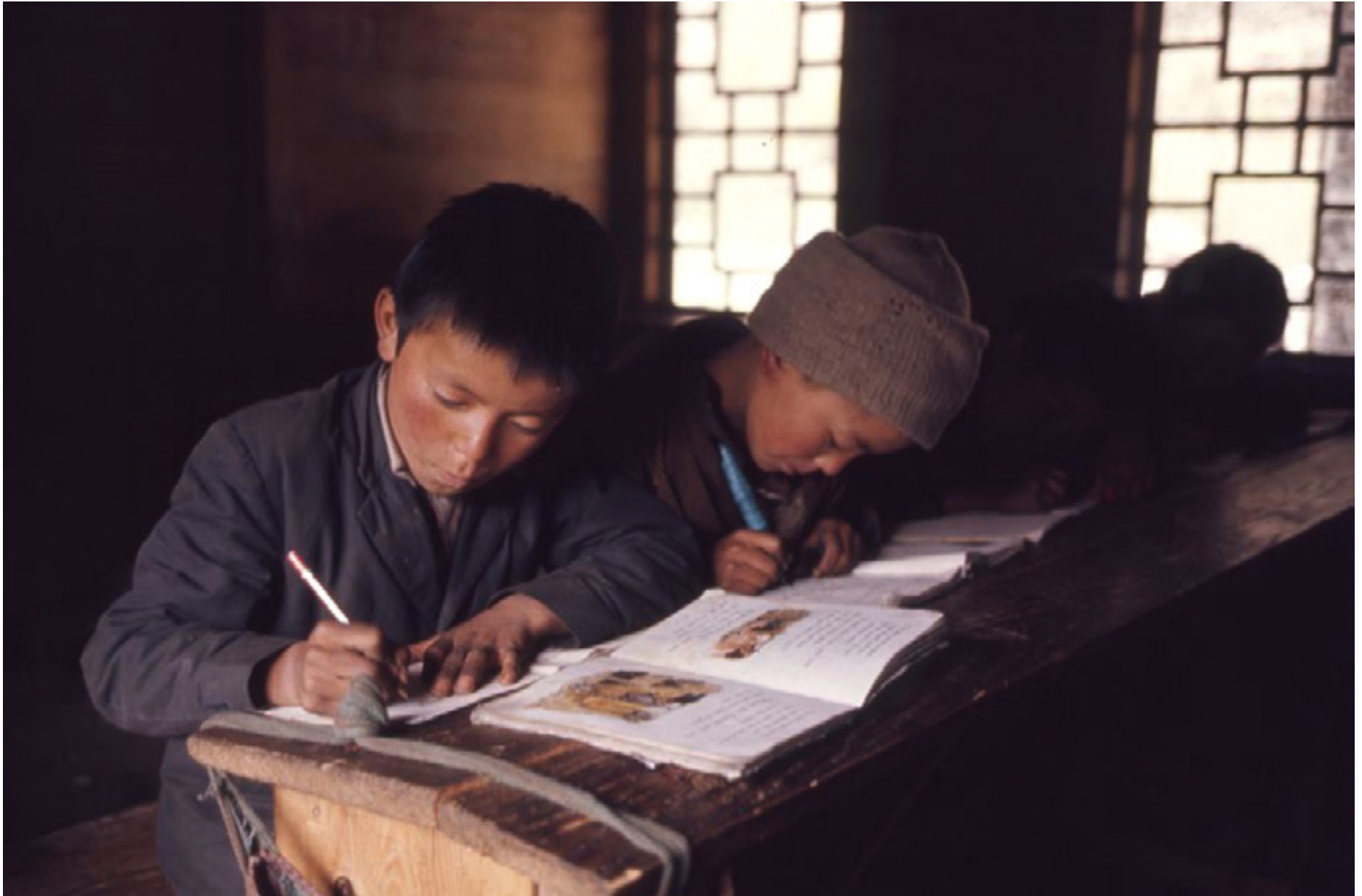
Kandell, Alice S., "Laching school," between 1965 and 1979.