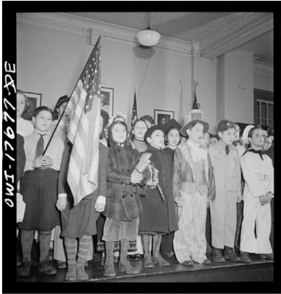
Collins, Marjory, “New York, New York students pledging allegiance to the flag in public school eight in an Italian-American section,” January 1943. Courtesy of Library of Congress