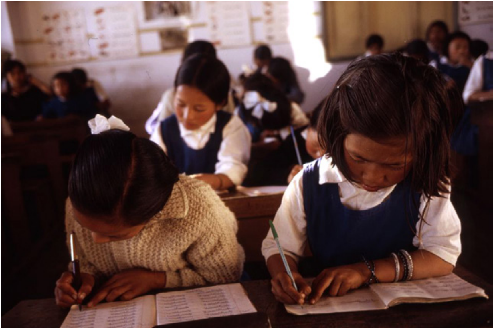
Kandell, Alice S., "School children at the Paljor Namgyal Girls School, Sikkim," January 1969.