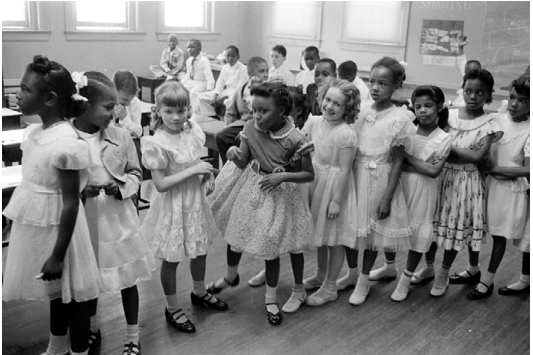
"School integration. Barnard School, Washington, D.C.," 27 May 1955.