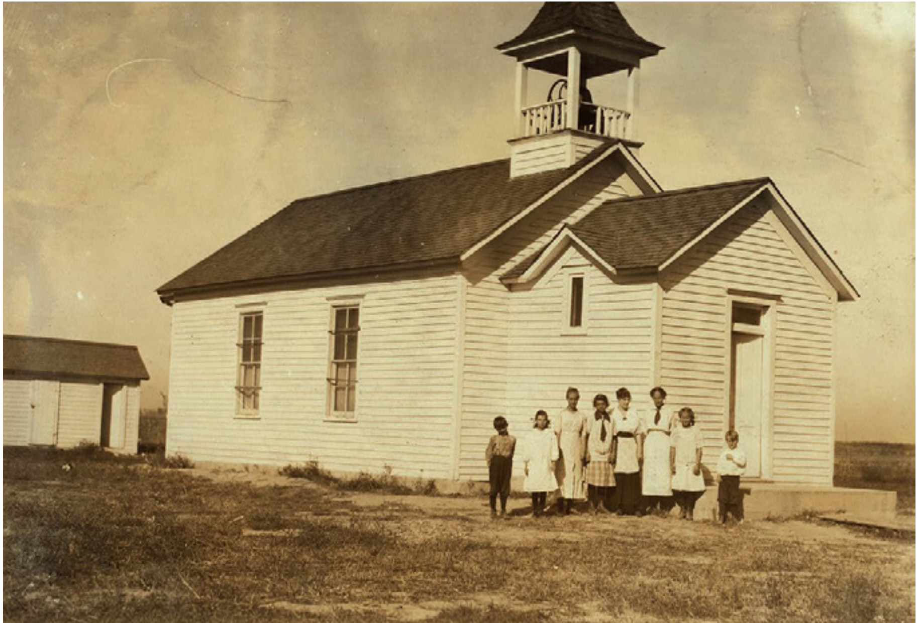
Hine, Lewis Wickes, "Williams School - Brush, Colo.," 27 October 1915. Courtesy of Library of Congress