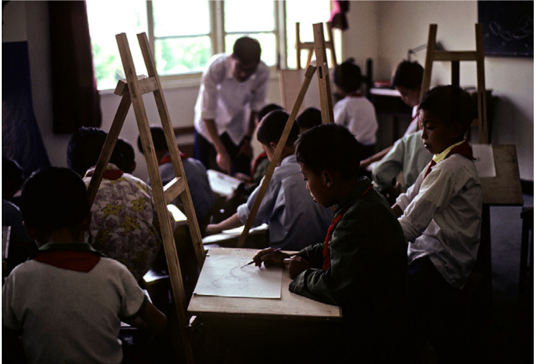
Norwood, Jean E., “Children learning to draw in an art class at a “commune school” in China,” 1979.