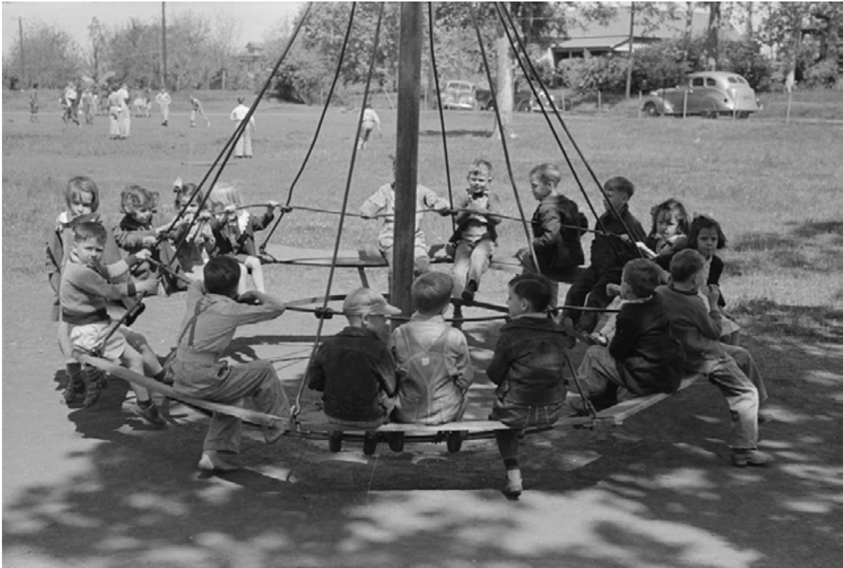
Lee, Russell, "Schoolchildren on circular swing, San Augustine, Texas," April 1939. Courtesy of Library of Congress