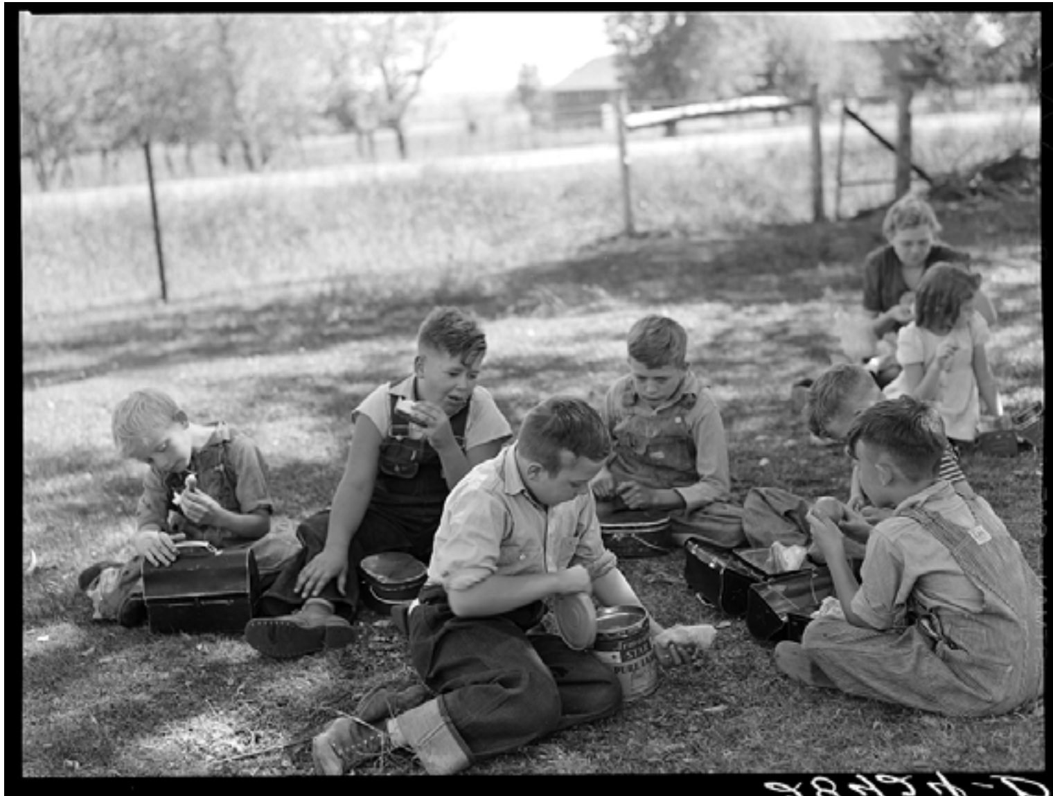
Rothstein, Arthur, "Lunch hour at country school. Grundy County, Iowa," October 1939.