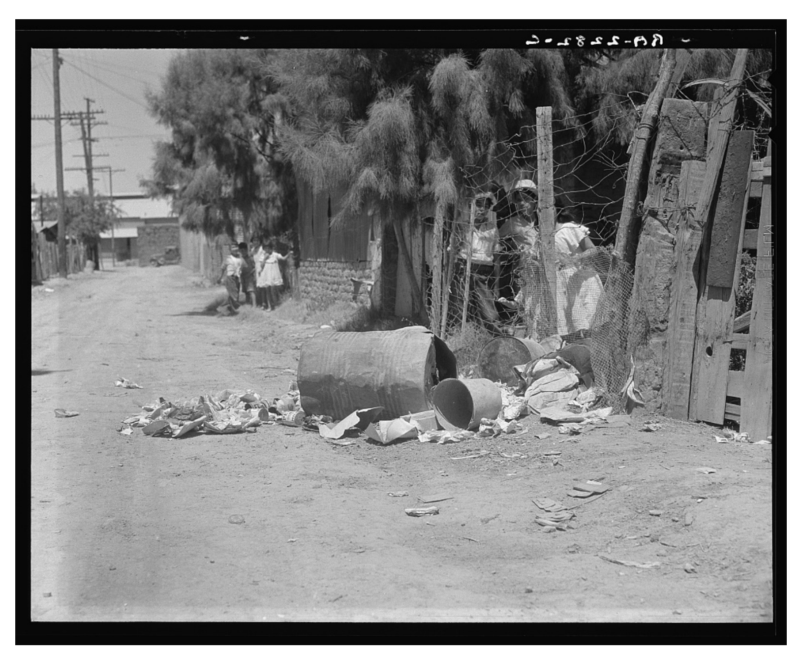
Lange, Dorothea, "Garbage disposal. Brawley, Imperial Valley, California," June 1935.