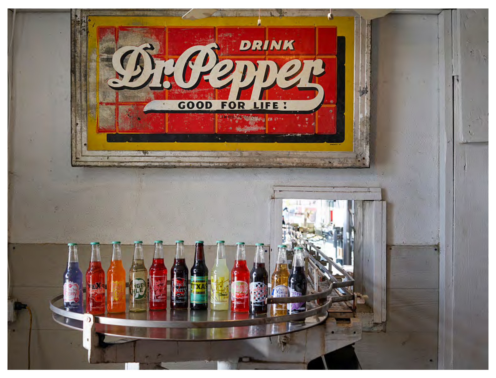
Highsmith, Carol M., "Display of company sodas on the bottling line at the Dublin Bottling Works and W.P. Kloster Museum in Dublin, Texas," 5 September 2014. Courtesy of Library of Congress