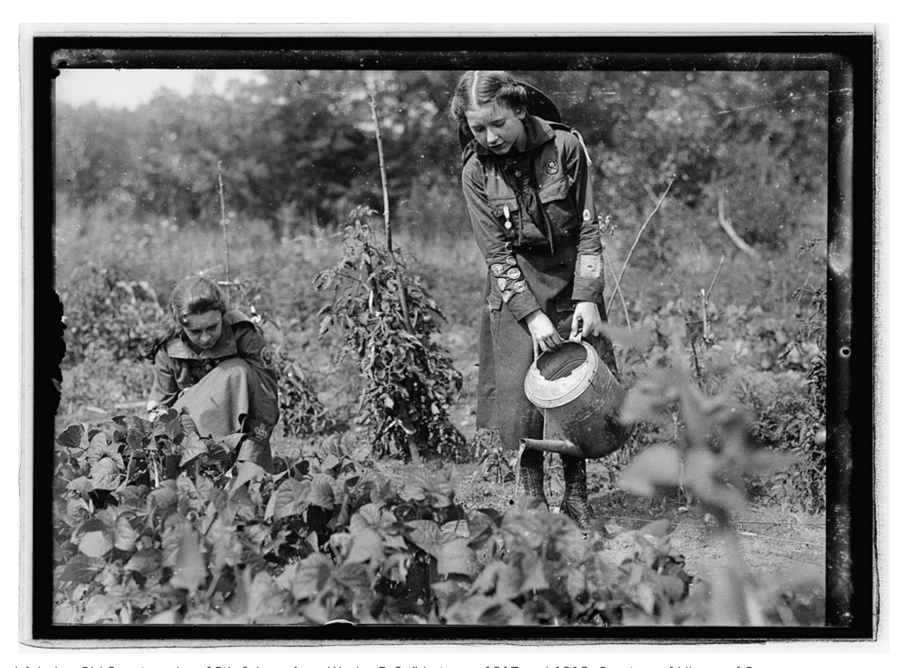
"Food Admin., Girl Scout garden, 13th & Iowa Ave., Wash., D.C.," between 1917 and 1918.