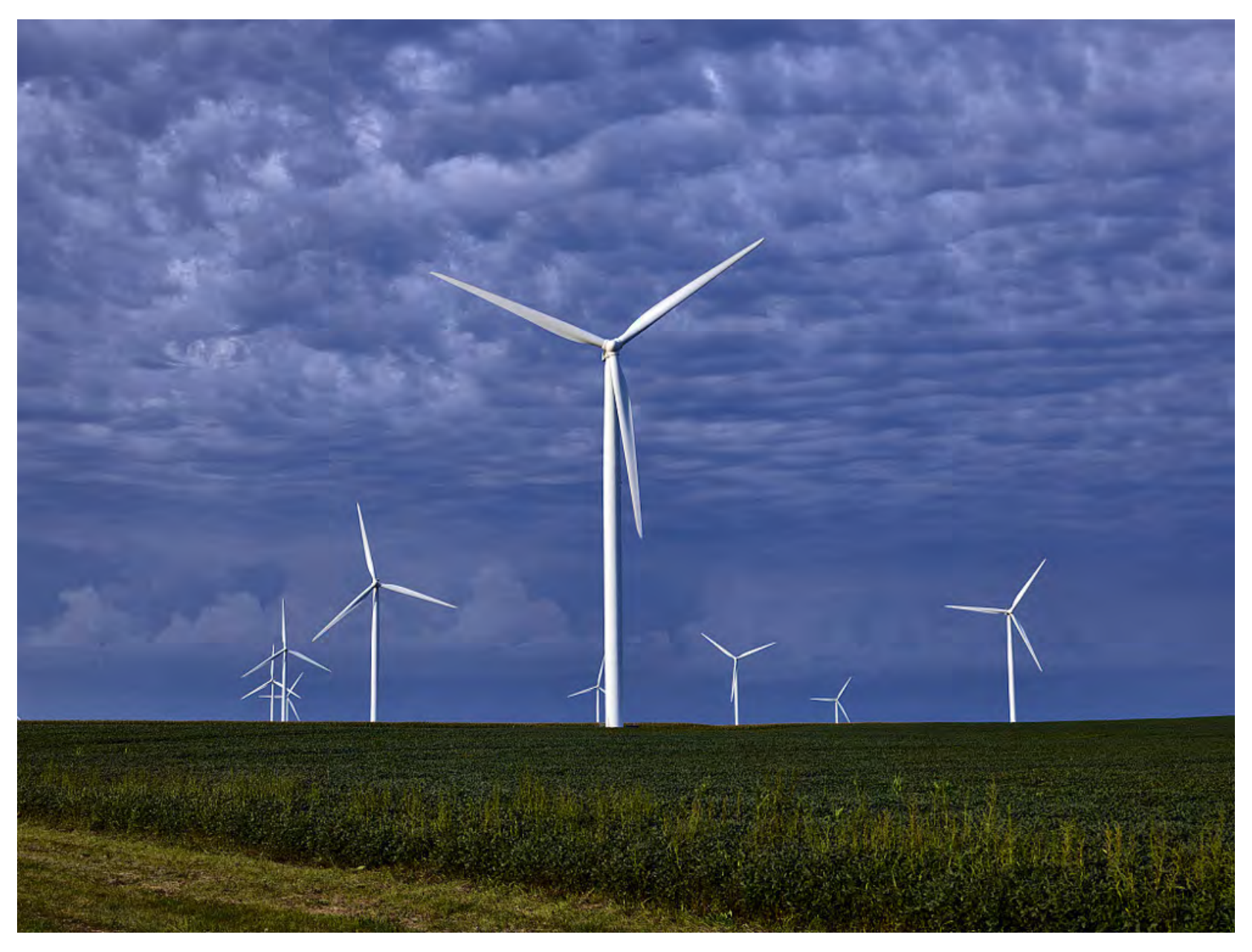
"Wind farms filled with giant wind turbines have become a familiar site on actual American prairie farms, including this one in Franklin County, Iowa," 17 August 2016.