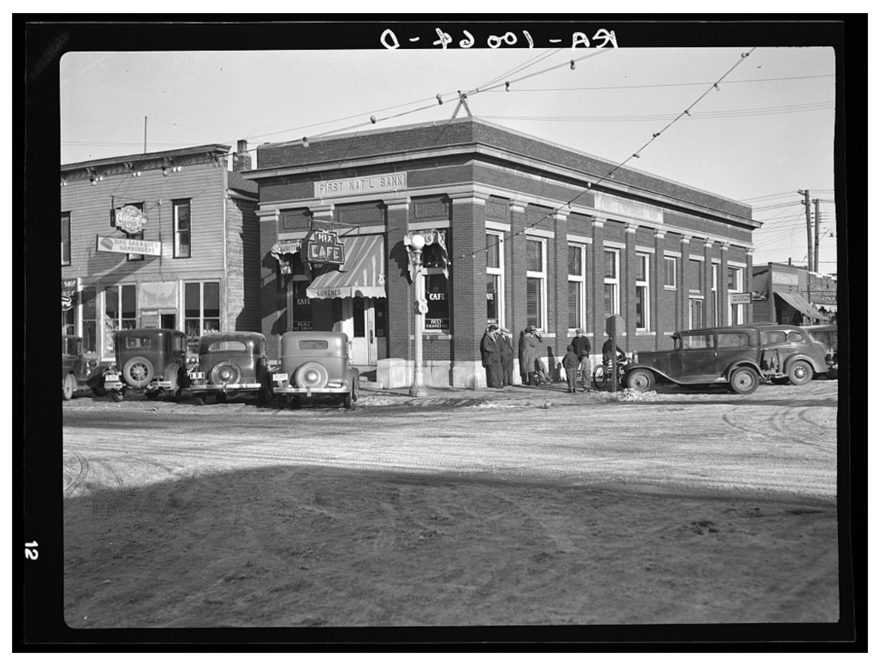
Lee, Russell, "Former bank building in Milford, Iowa. Now a cafe," December 1936. Courtesy of Library of Congress