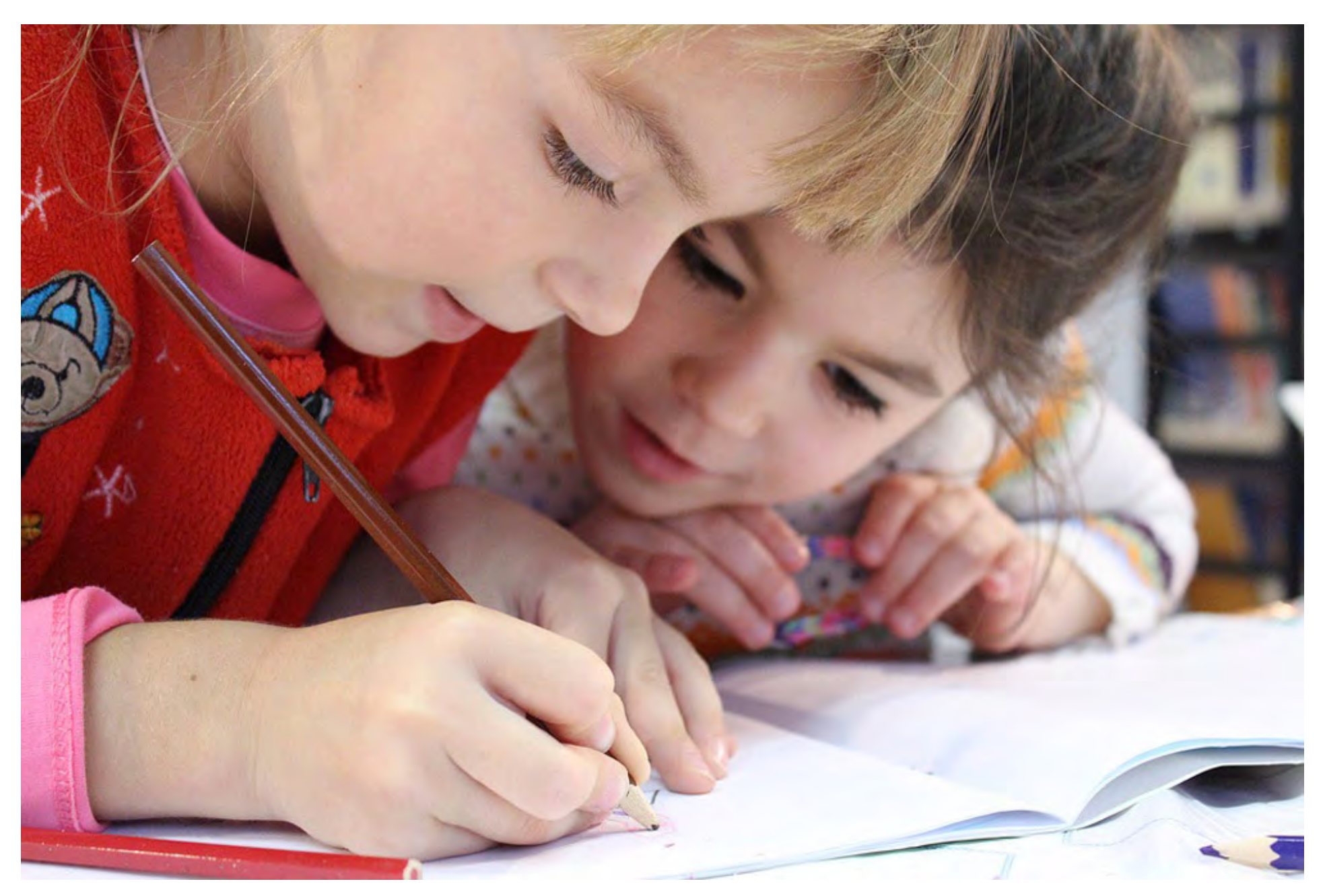
12 December 2015.