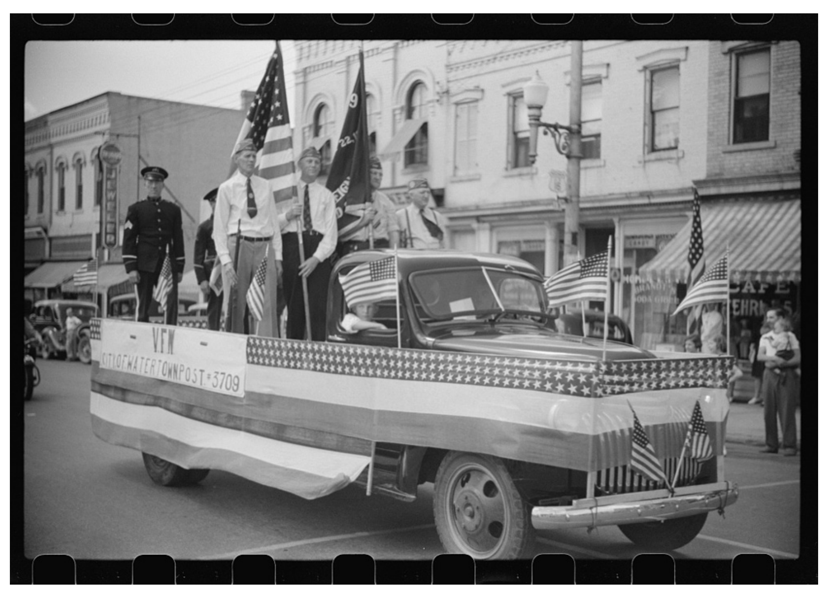
Vachon, John, "[Untitled photo, possibly related to: American Legion in Fourth of July parade, Watertown, Wisconsin]," 4 July 1941. Courtesy of Library of Congress