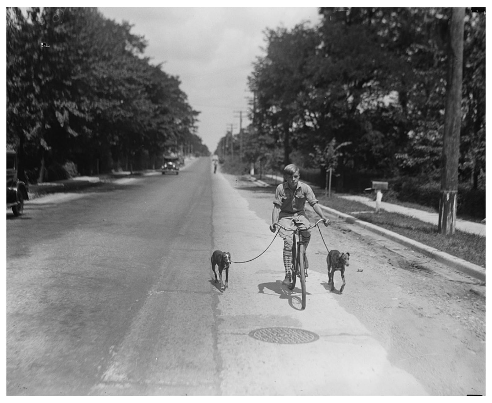
Harris & Ewing, "[Boy riding bicycle with dogs on leashes]," 1928. Courtesy of Library of Congress