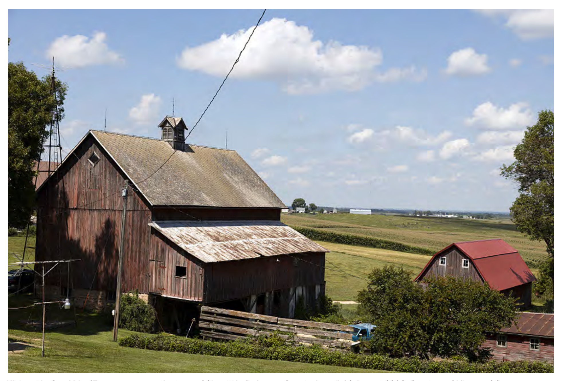
"Farm scene near the town of Sherrill in Dubuque County, Iowa," 16 August 2016.