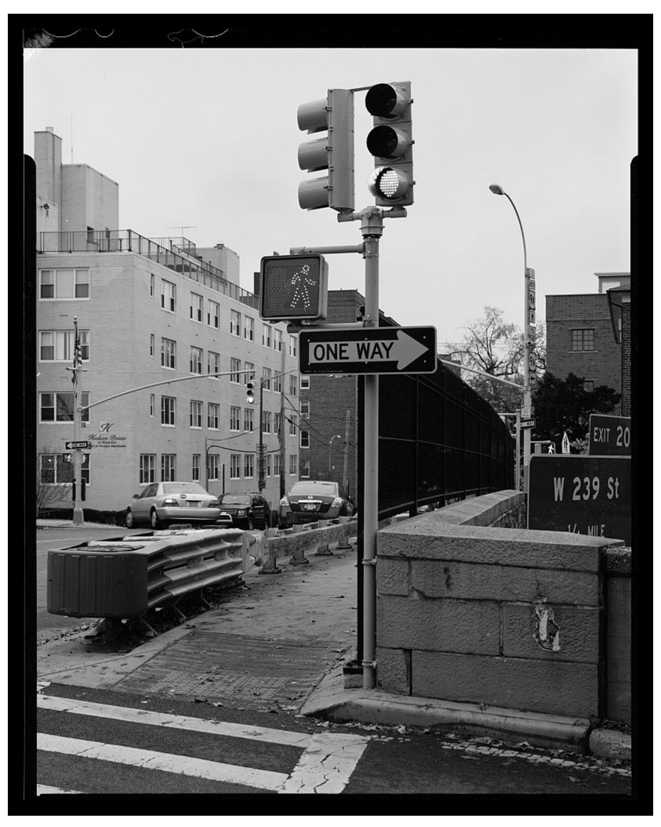
Bieretz, Renee, "Deck of West 232nd Street overpass, showing wide W beam collision barrier, double-faced wooden guardrail, pedestrian fencing in front of parapet, pedestrian ramp, crosswalk, traffic light, and oversized signage, looking southeast. - Henry Hudson Parkway, Extending 11.2 miles from West 72nd Street to Bronx-Westchester border, New York County, NY," 2012.