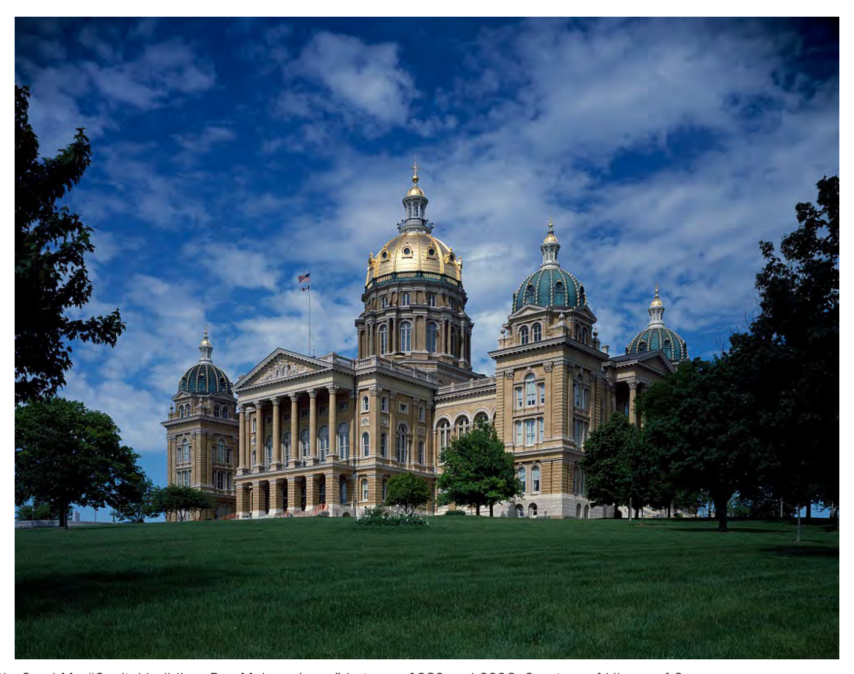
Highsmith, Carol M., "Capitol building, Des Moines, Iowa," between 1980 and 2006. Courtesy of Library of Congress