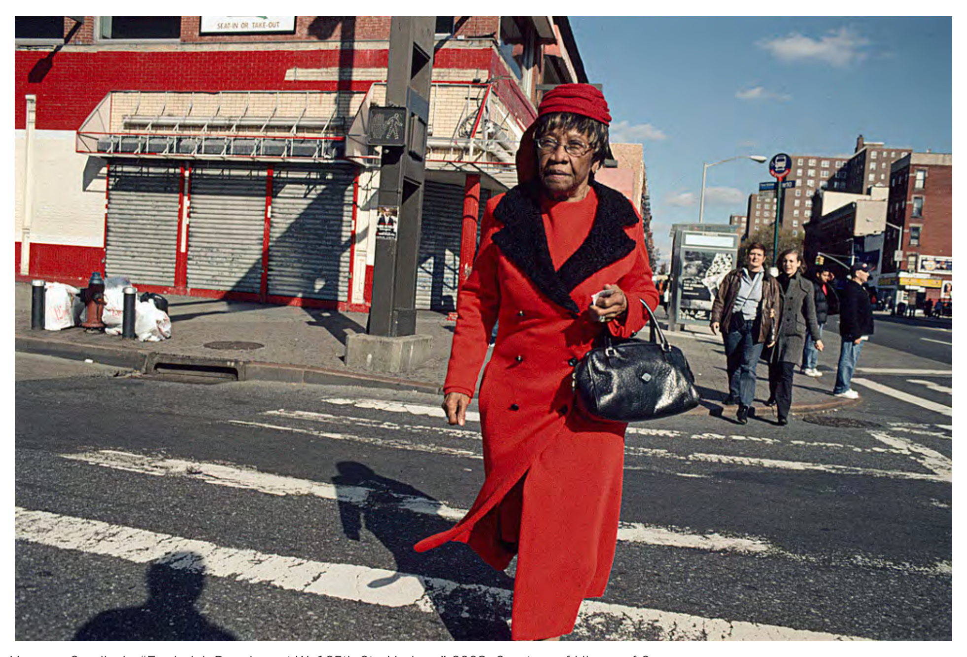
Vergara, Camilo J., "Frederick Douglass at W. 125th St., Harlem," 2008.