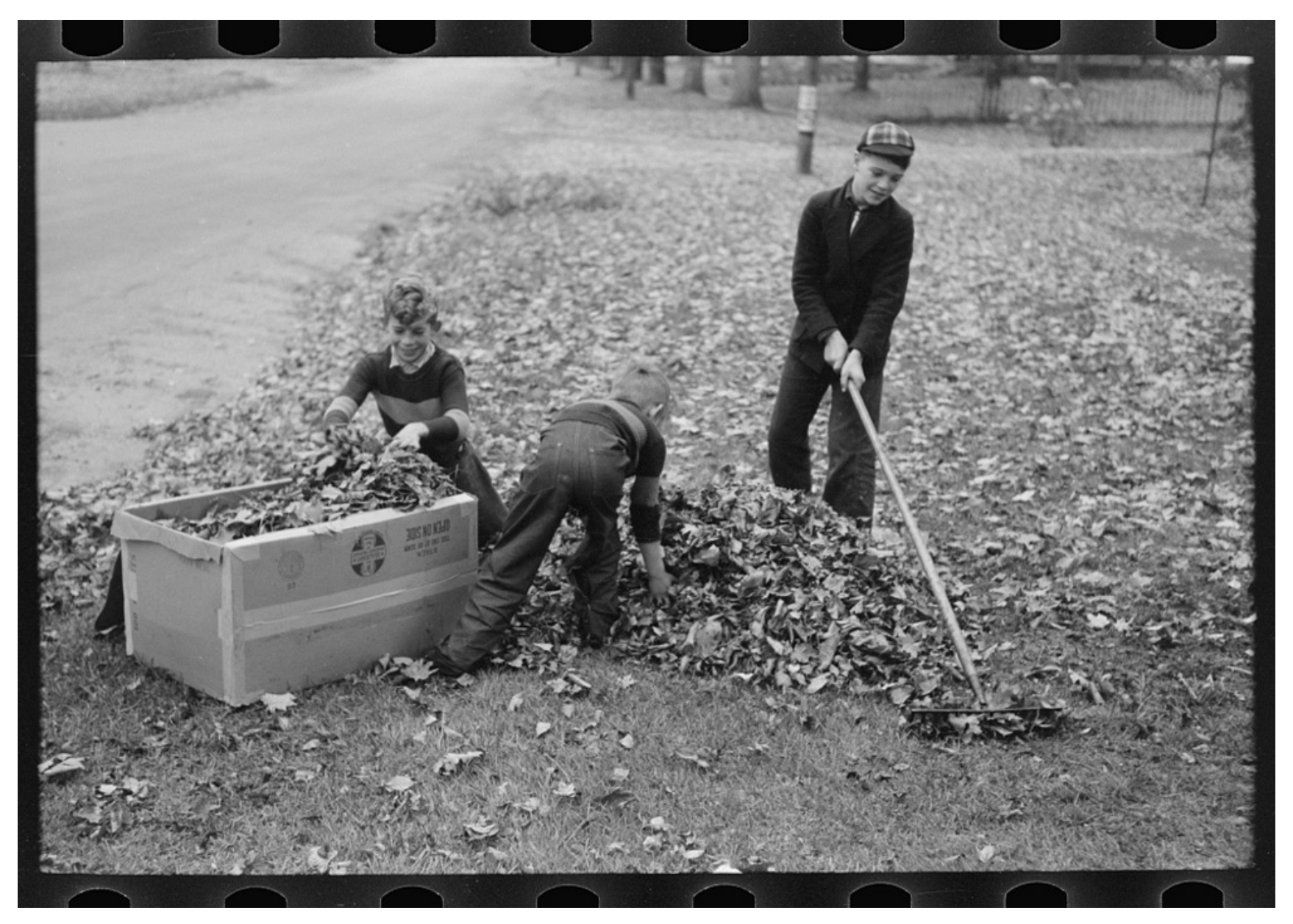
Lee, Russell, "Boy raking up leaves on front lawn, Bradford, Vermont," October 1939. Courtesy of Library of Congress