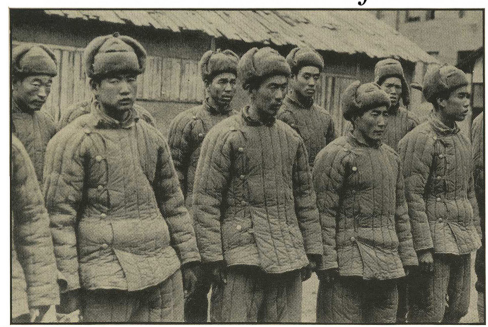
New U.N. foe. First Chinese Communists taken prisoner

Red China's attack threatens U.N. victory as Mao moves on three fronts