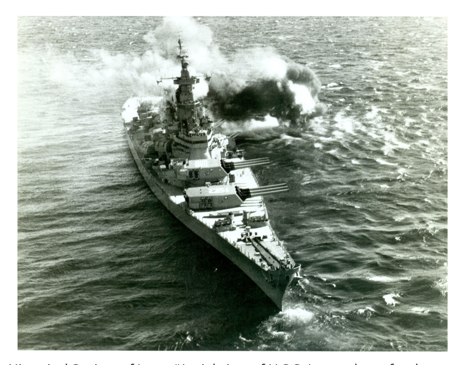
"Aerial view of U.S.S. Iowa taken after battery gunfire aimed at Communist defenses. Offshore Koje, Korea," 17 October 1952