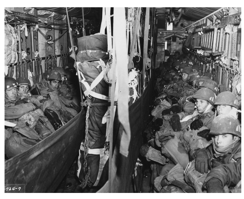
Courtesy of National Archives, "COMBAT CARGO, KOREA - Paratroopers of the 187th Airborne Regimental Combat Team..." March 1951