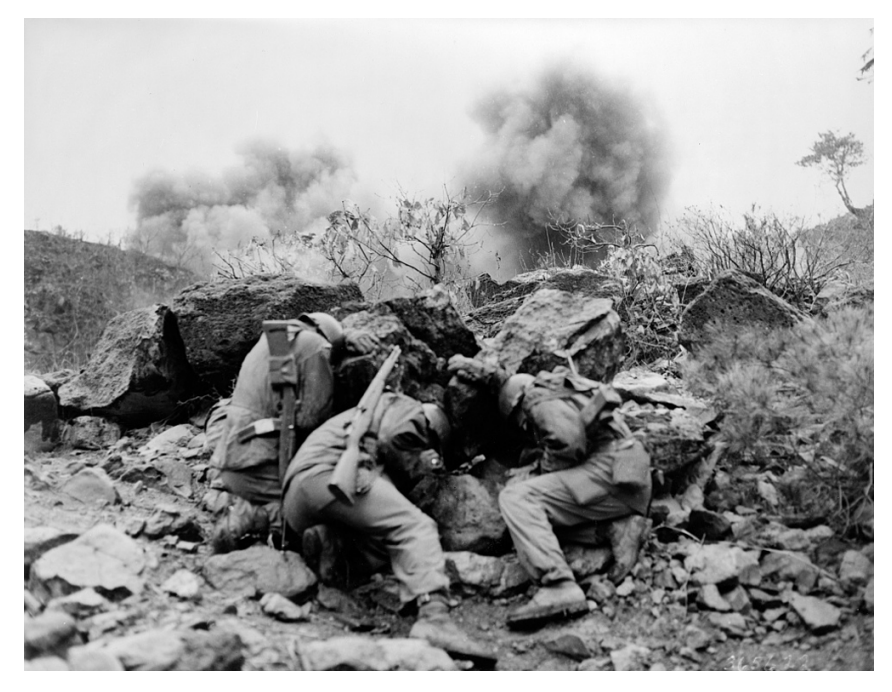
Courtesy of Library of Congress, Signal Corps, U.S. Army, 11 April 1951