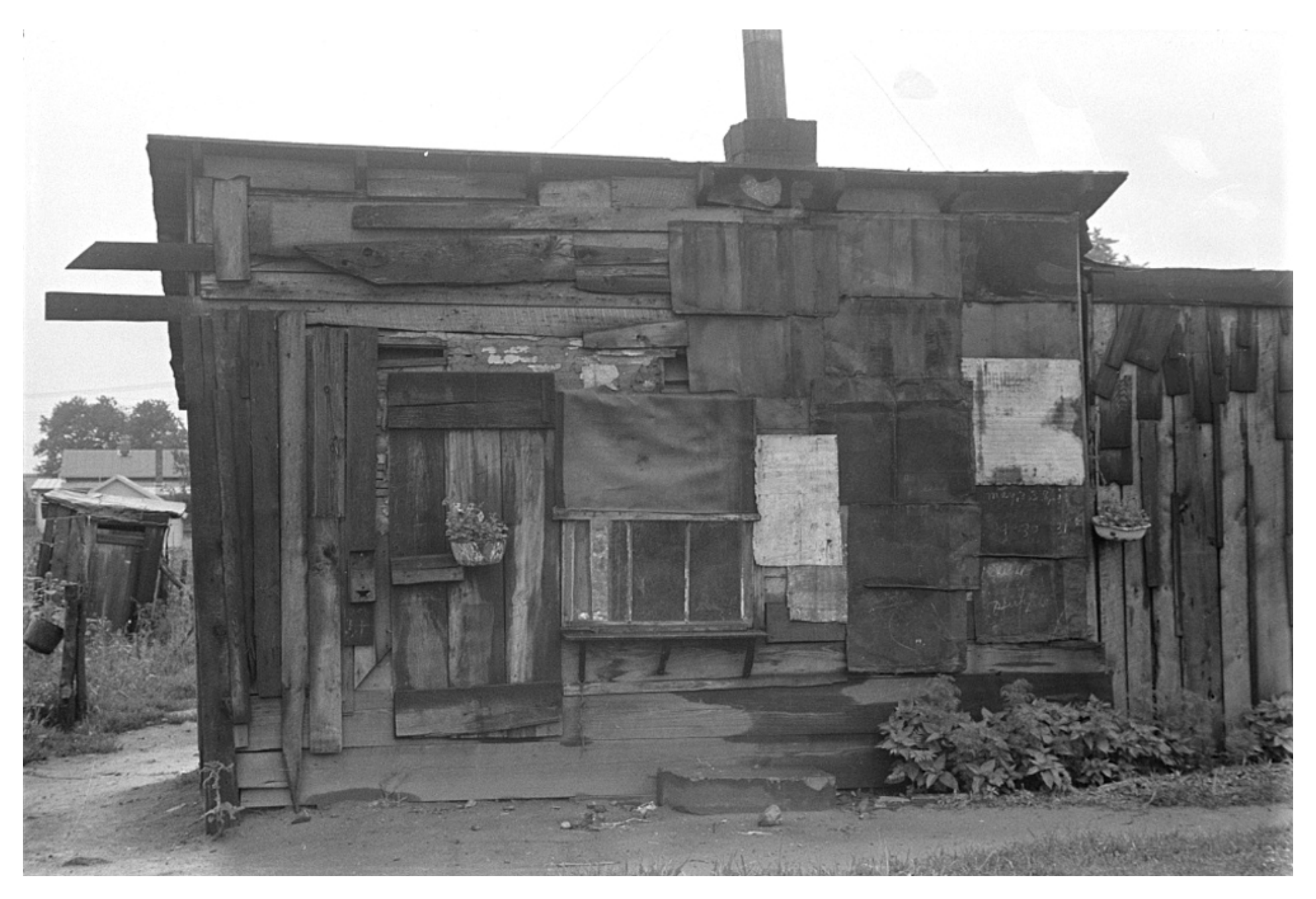
Shahn, Ben, "Untitled photo, possibly related to: Dwellers in Circleville's 'Hooverville,' central Ohio," 1938.