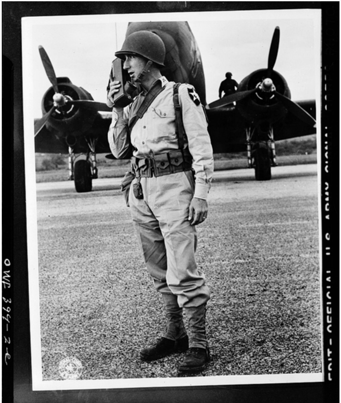
“Airborne Infantry officer using a “walkie-talkie,” a radio field telephone, during maneuvers of the Third Army, commanded by Lieutenant General Walter Kreuger,” 1942.