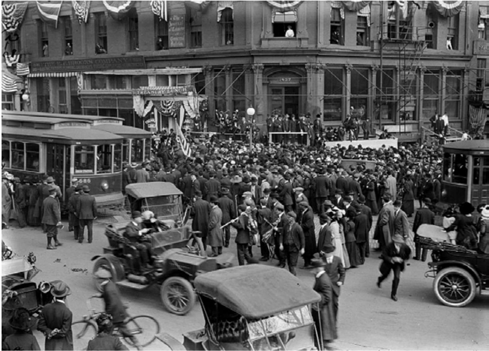
Harris & Ewing, "Crowd and Trolley cars at corner of Pennsylvania Ave. and 15th Street, N.W., Washington, D.C.," between 1913 and 1917. Courtesy of Library of Congress