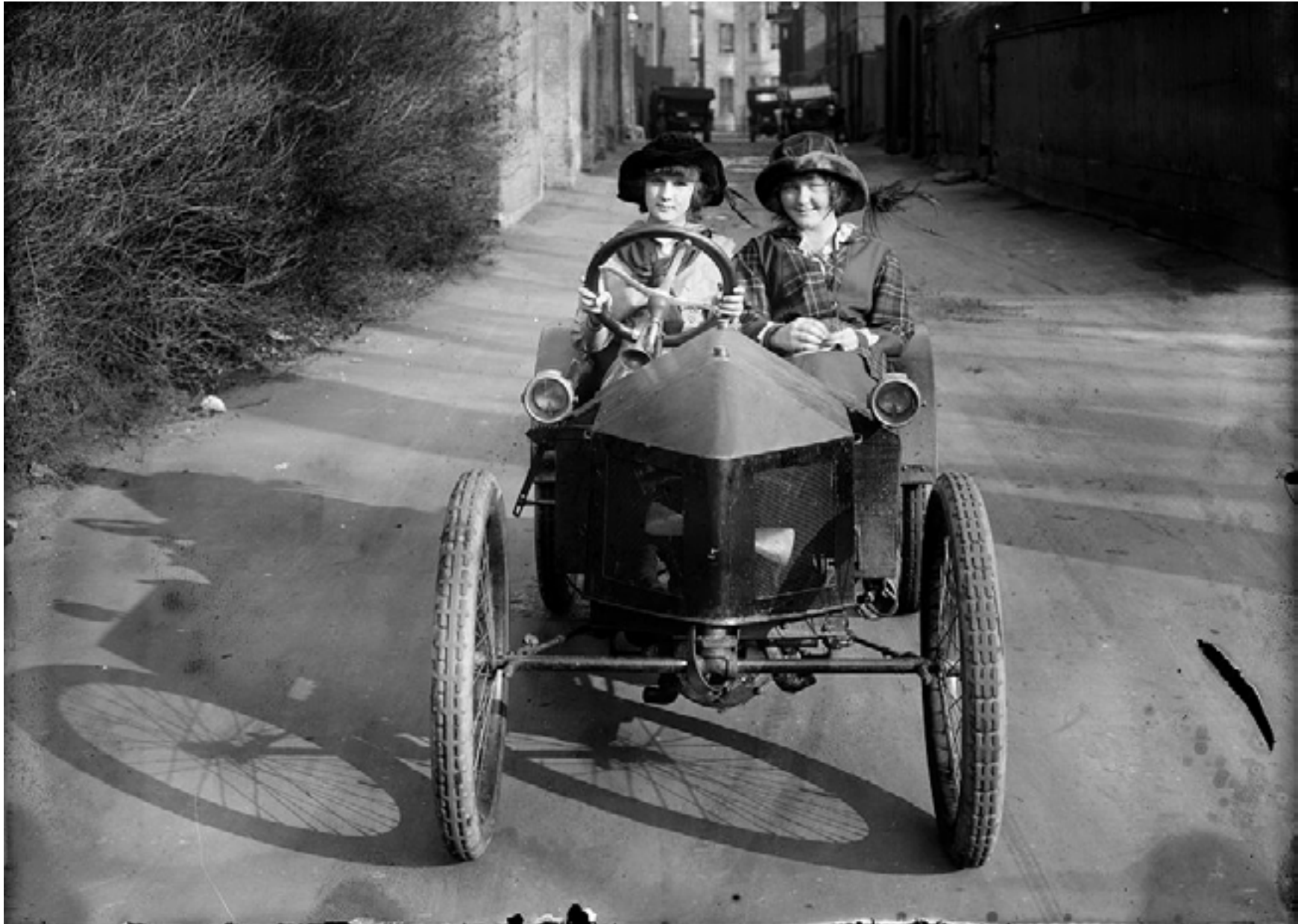
“Children in automobile,” between 1912 and 1930.