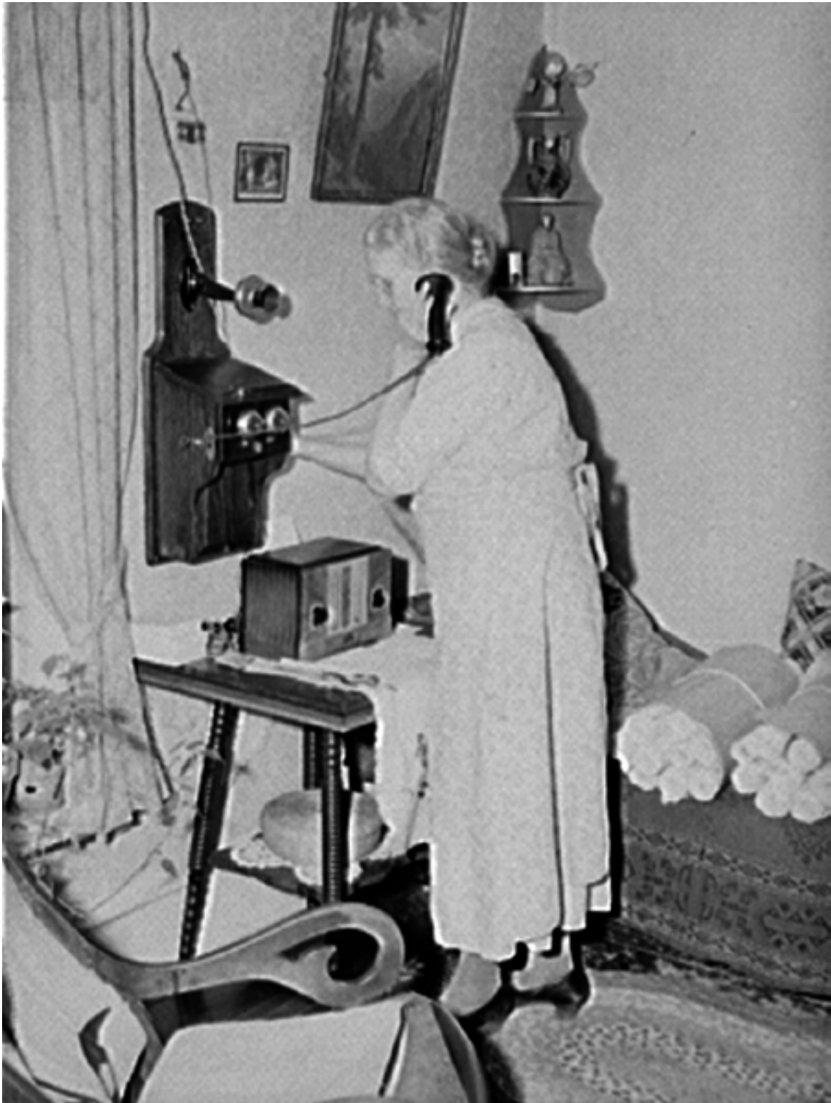
Vachon, John, "Lady signaling operator on old style telephone. Scranton, Iowa," April 1940. Courtesy of Library of Congress