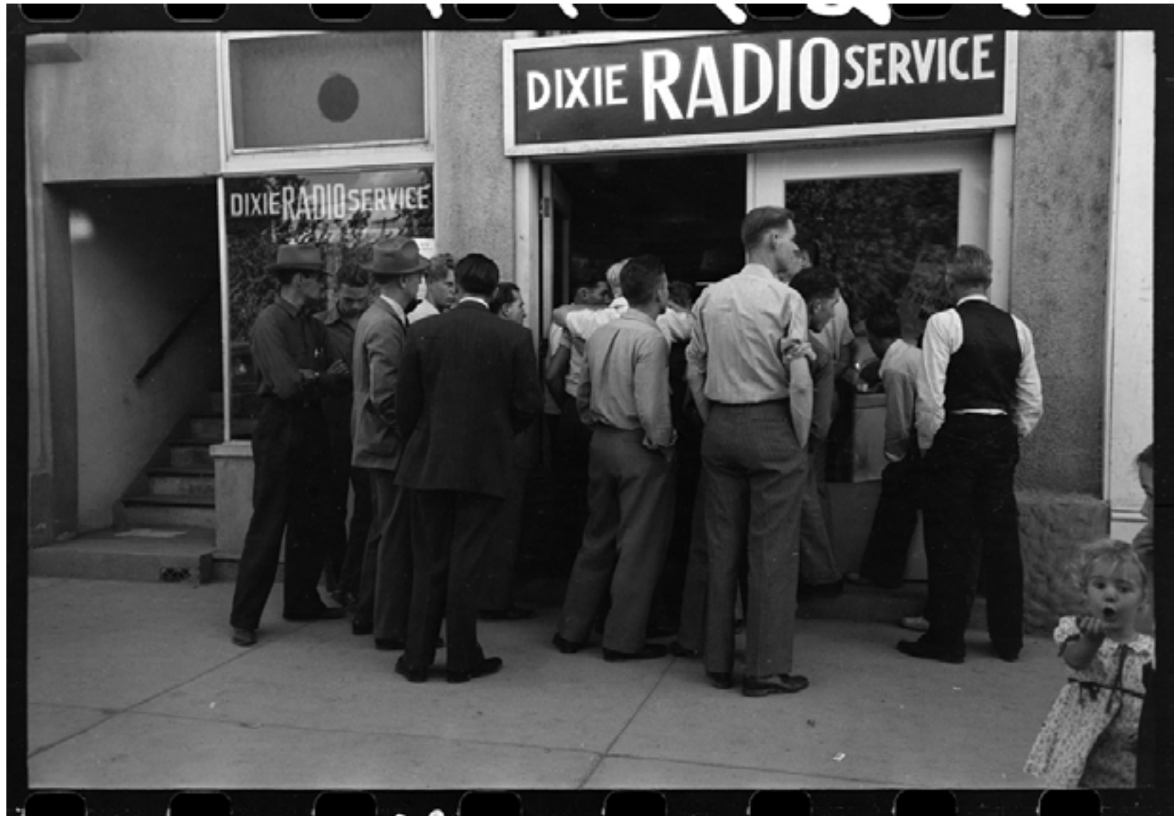
Lee, Russell, "A crowd of men listening to World Series game, Saint George, Utah," September 1940. Courtesy of Library of Congress