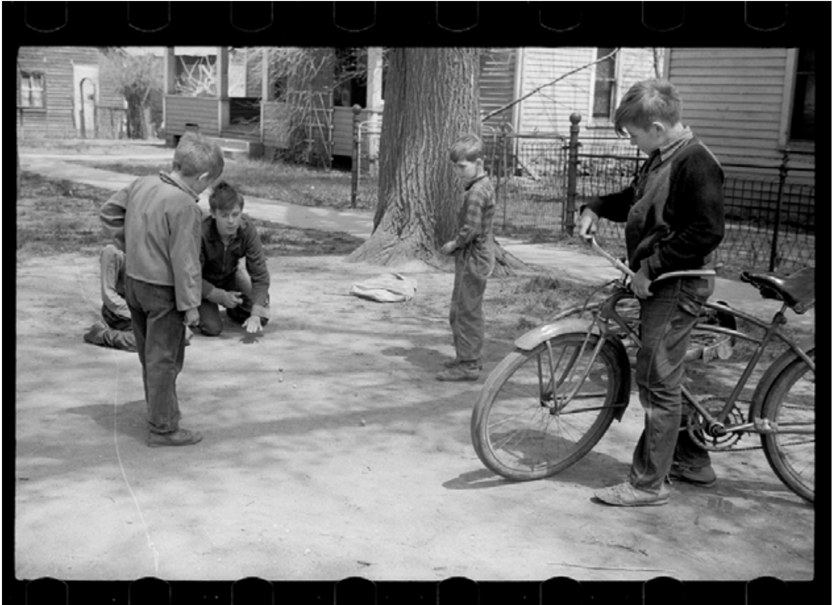
Vachon, John, "Boys playing marbles, Woodbine, Iowa," May 1940.