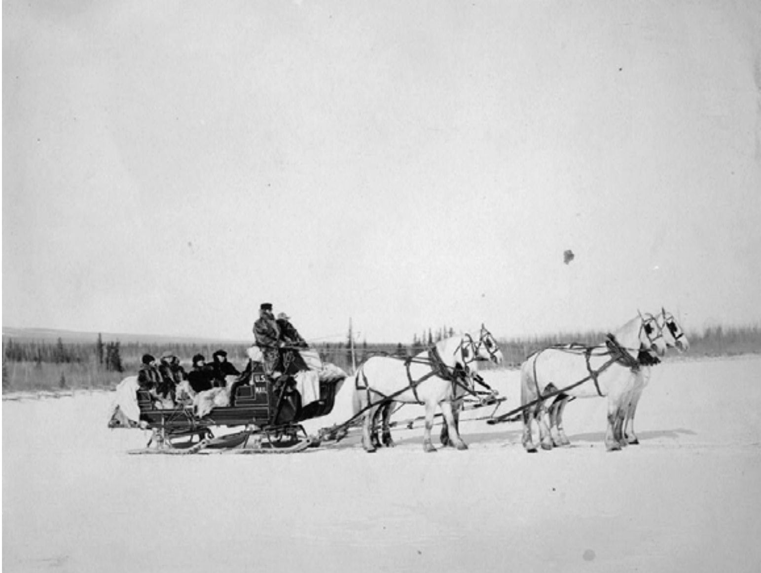
“Horses pulling U.S. Mail sled,” between 1900 and 1927.