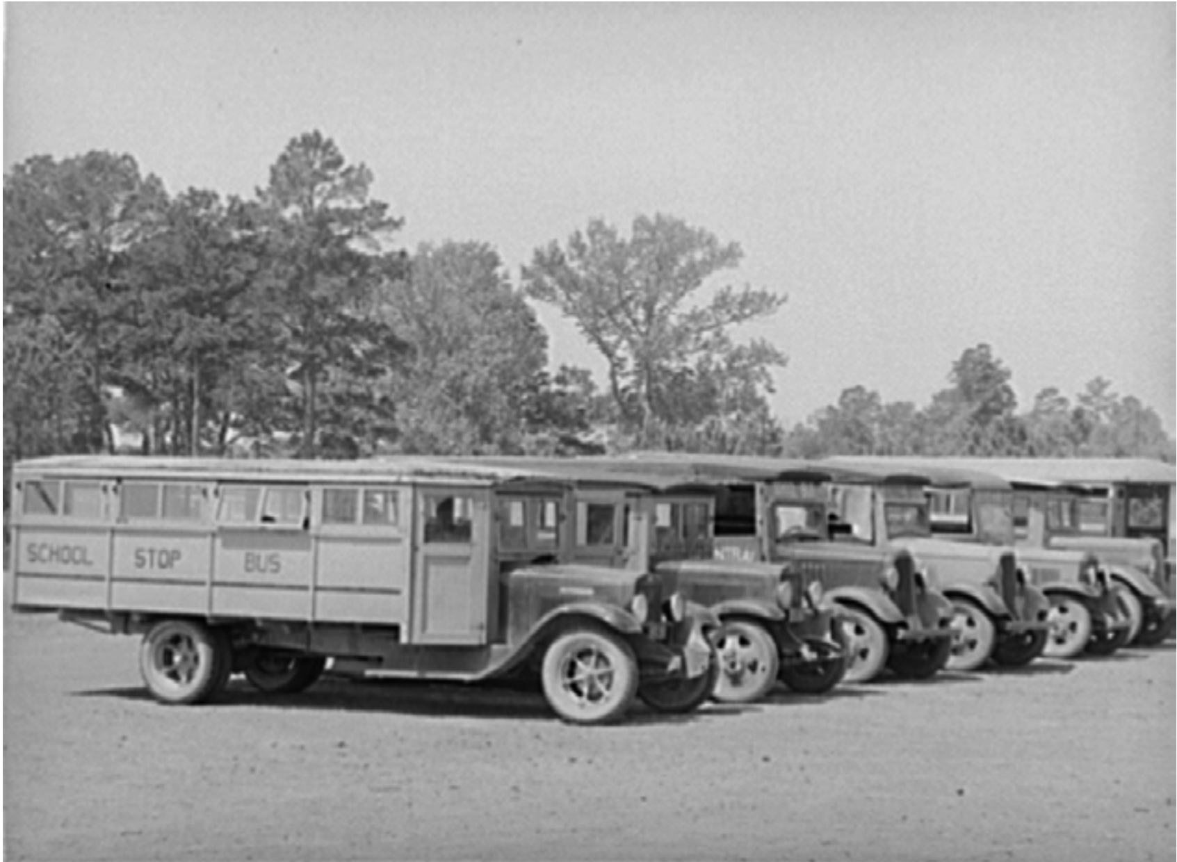
Lee, Russell, "Lineup of school buses near Wells, Texas," April 1939.