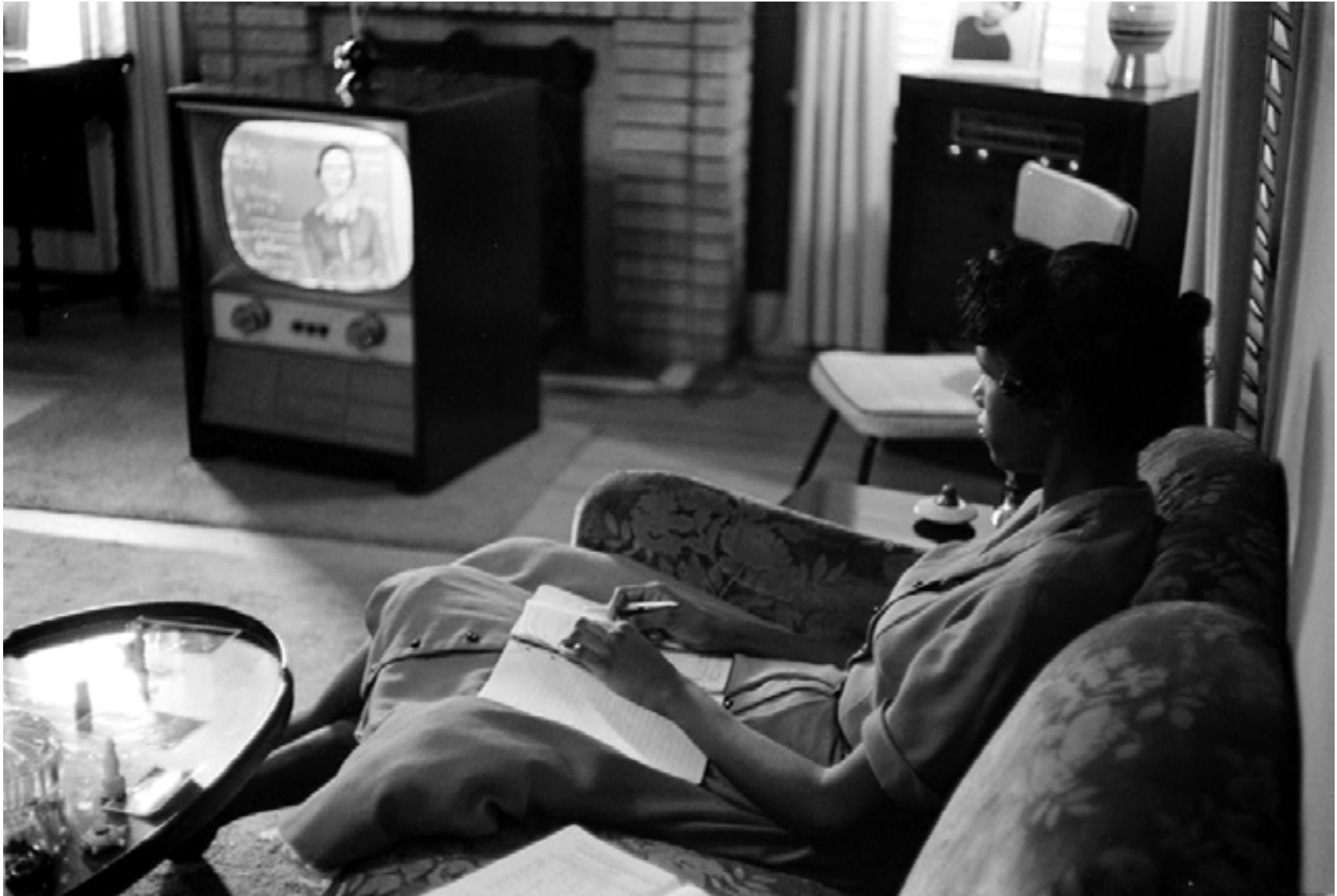
O'Halloran, Thomas J., "Little Rock, Arkansas. Filming high school classes / TOH," September 1958.