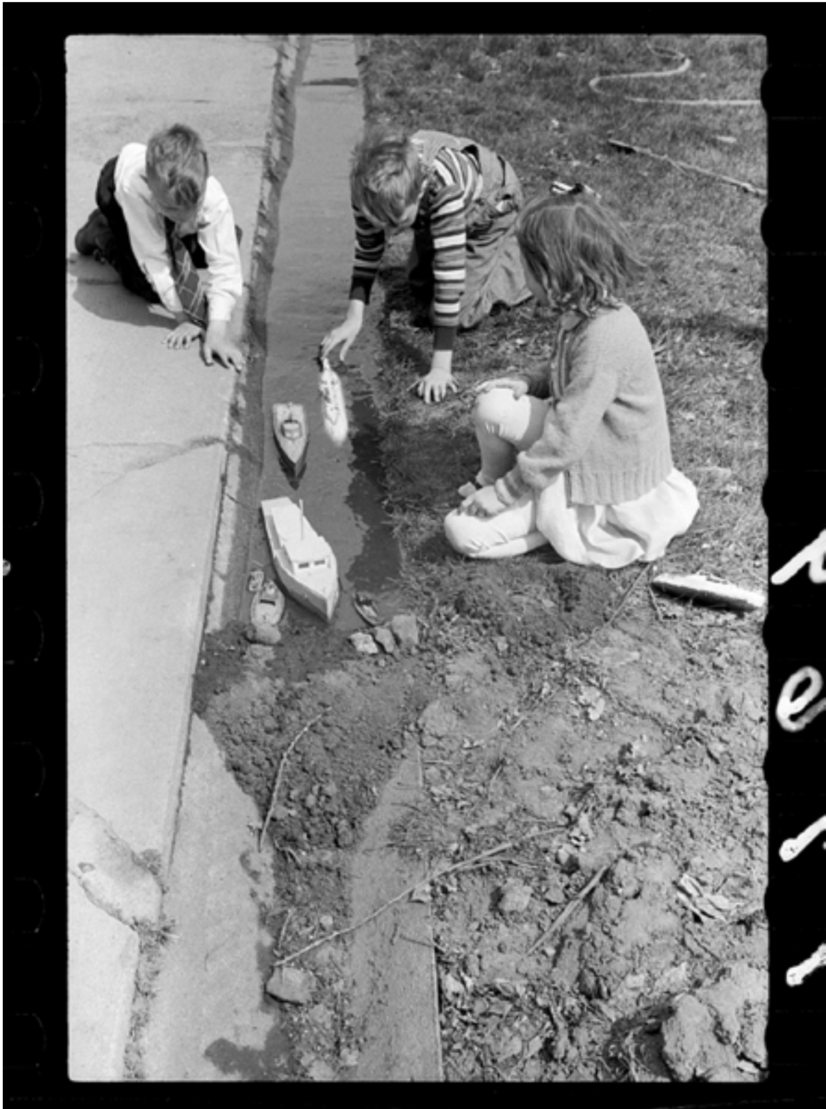
"Children playing with boats, Grundy Center, Iowa," April 1940.