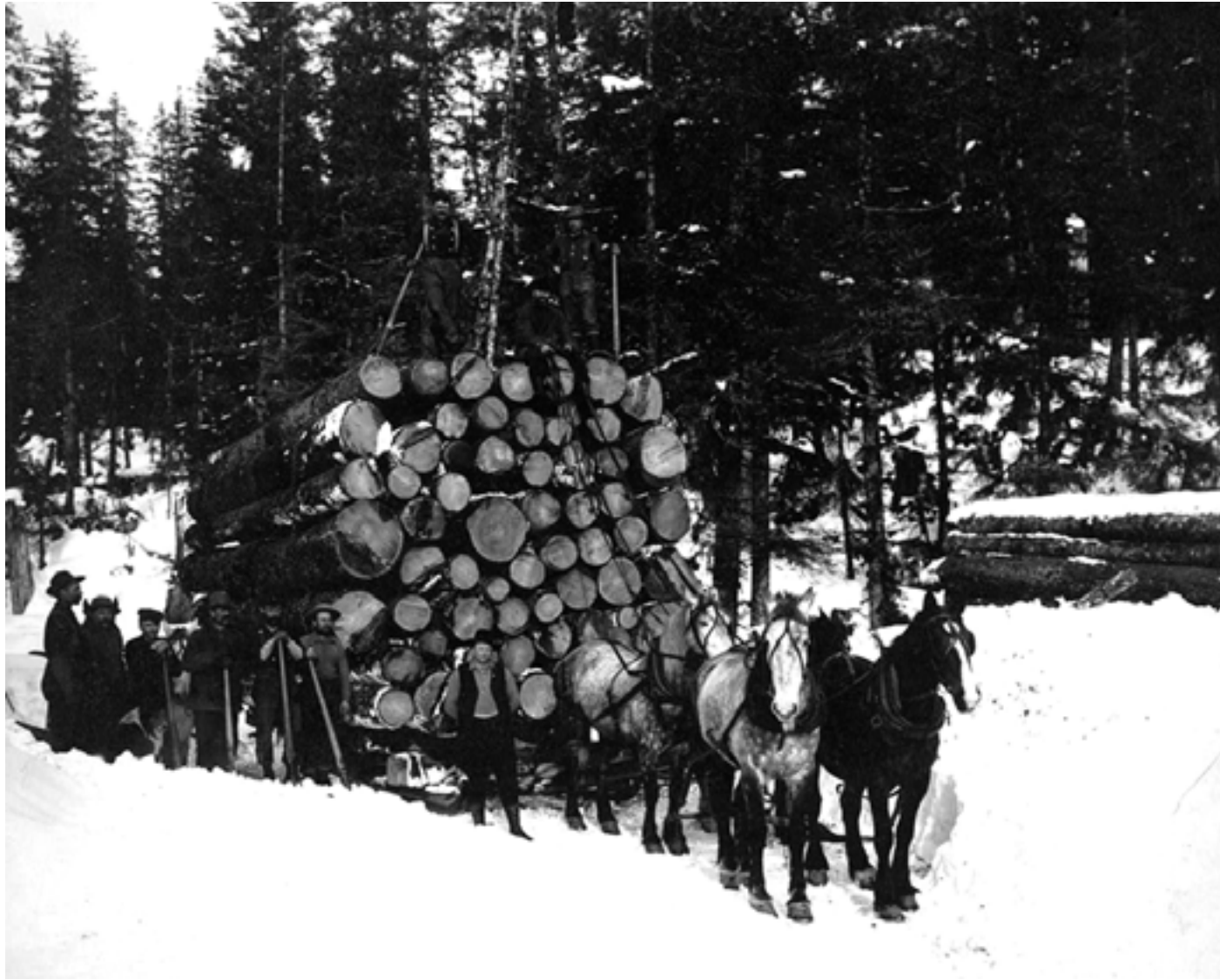
“Logs being hauled on a sleigh by a team of horses along the government railway, 35 miles from Seward,” between 1900 and 1930.