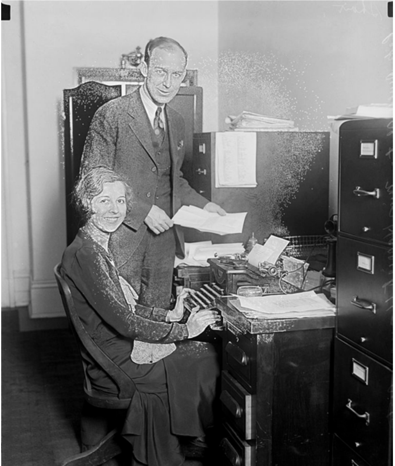
“Unidentified man and woman at desk with typewriter,” between 1909 and 1932.