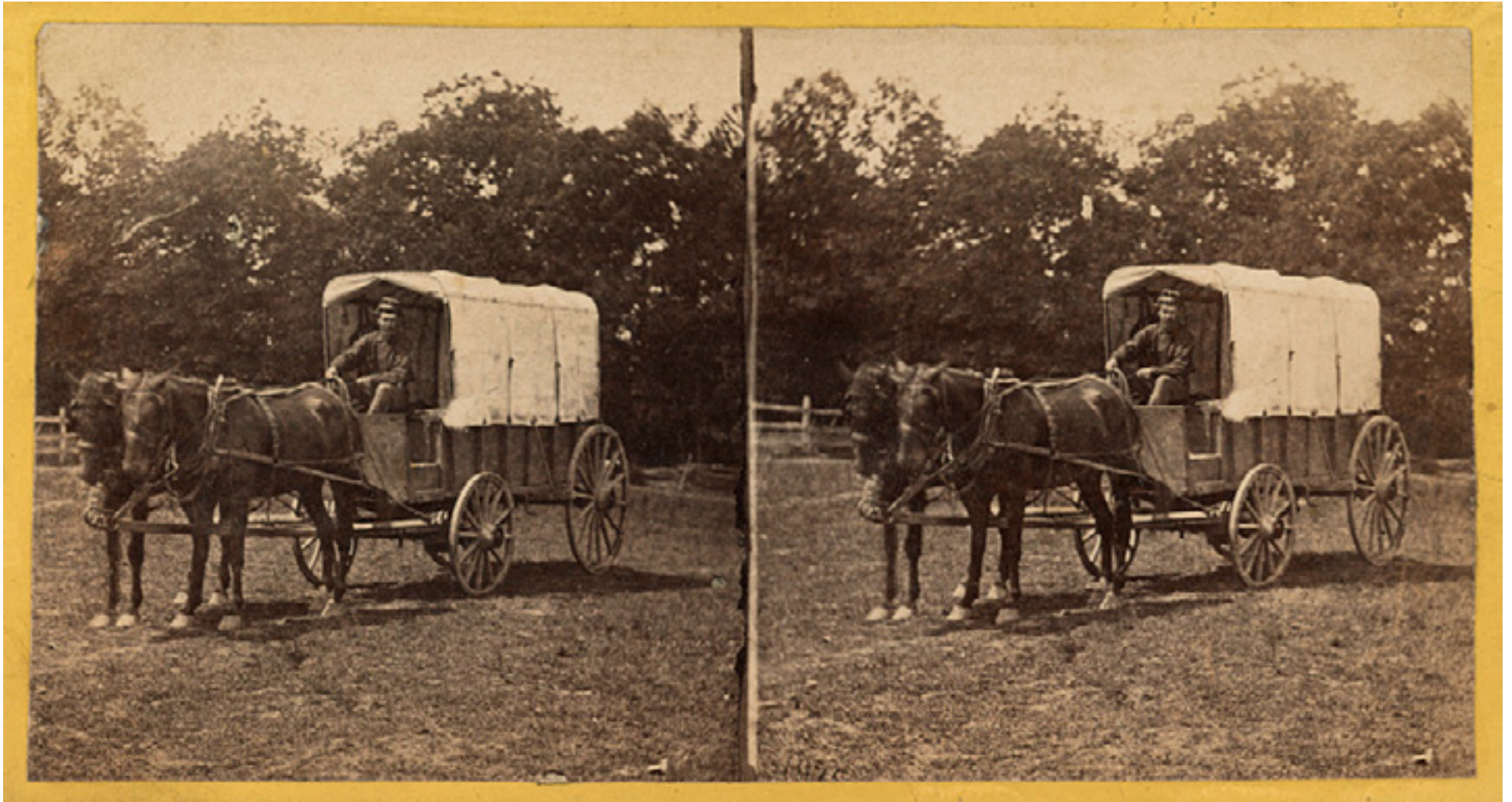
“Ambulance wagons on the battle field of Bull Run,” E. & H.T. Anthony, 1861. Courtesy of Library of Congress