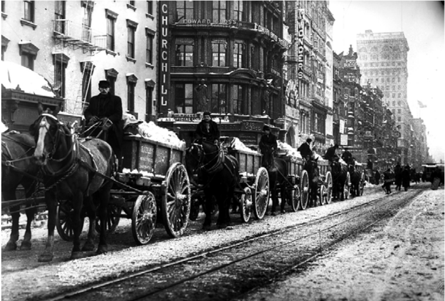
“Wagons removing snow,” New York, January 1908.