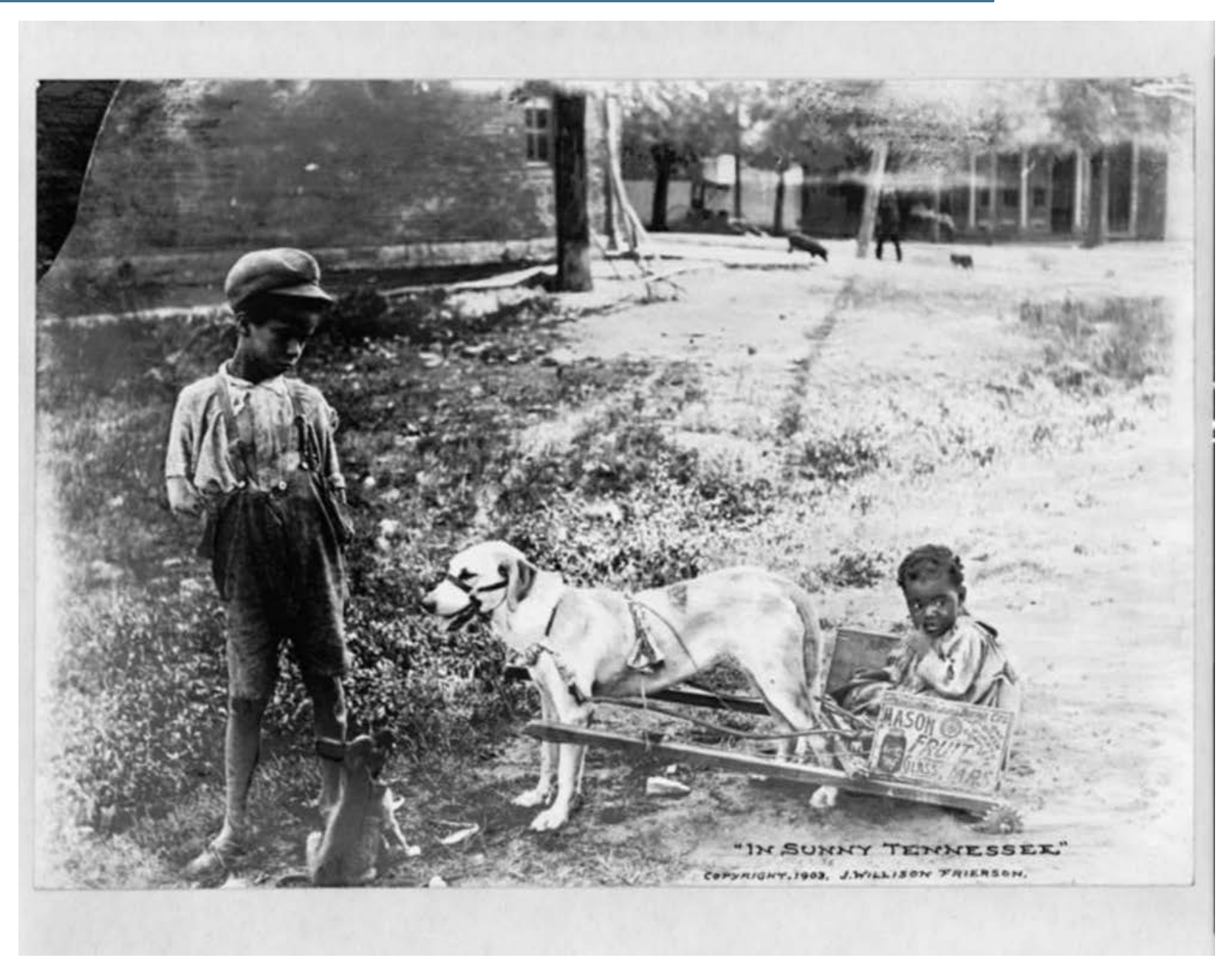
This photograph was taken in 1903 and shows two children playing in Tennessee. One of the children is being pulled in a cart by a dog. Courtesy of Library of Congress, "In Sunny Tennessee," ca. 1903