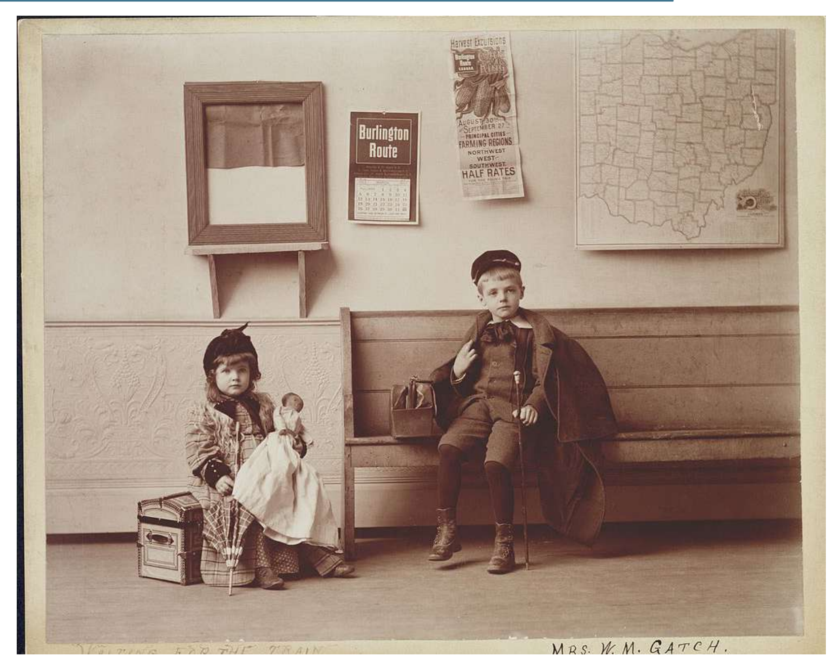
This 1893 photograph shows a boy and girl at a train station. The boy sits on a bench wearing a large cape, holding a walking stick, while the girl sits on a small trunk and holds a doll and parasol. Courtesy of Library of Congress, Gatch, W.M., "Waiting for the train," 30 June 1893