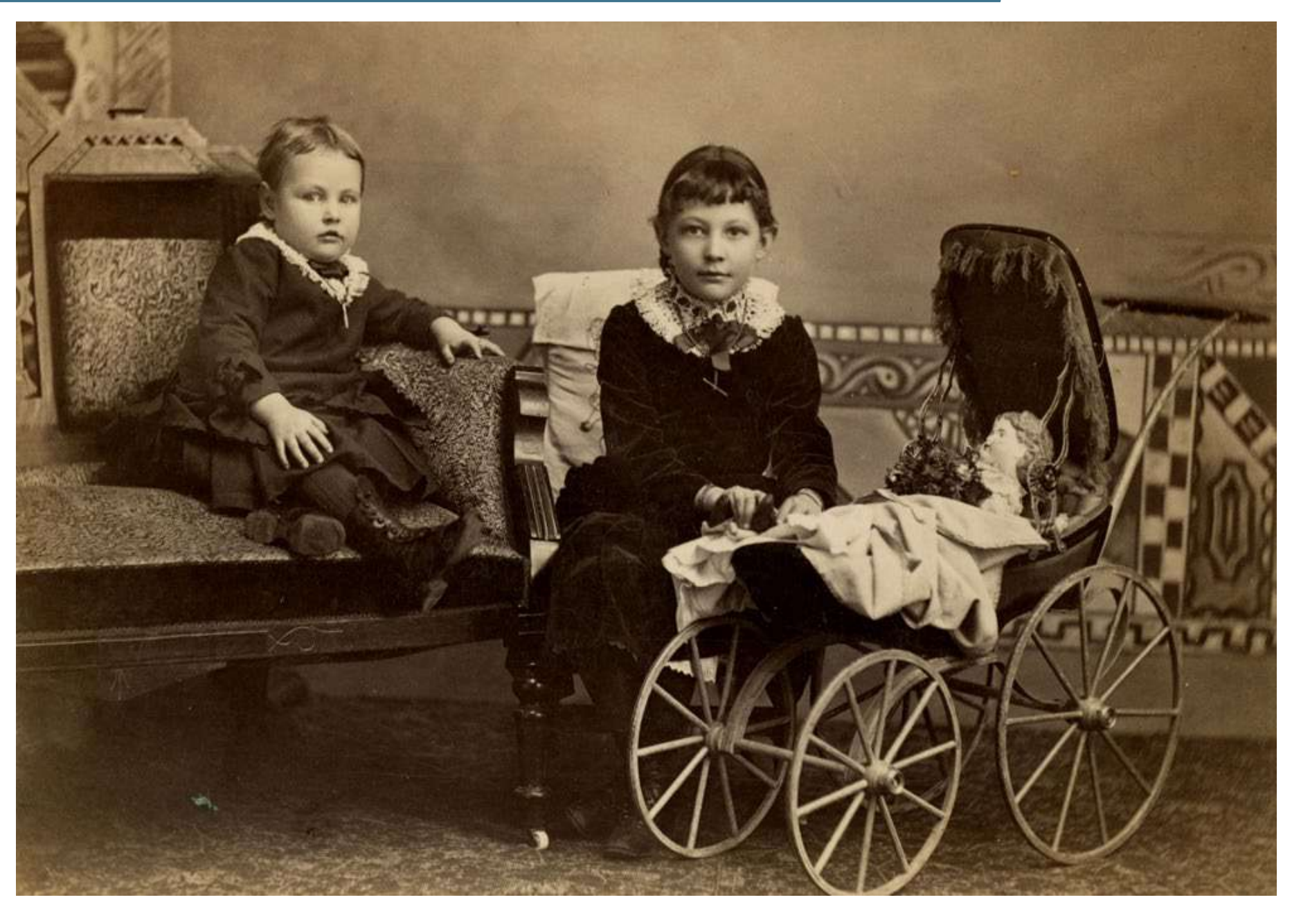
The portrait is of two young girls with doll, covered by a blanket, laying in their baby buggy. The photograph was taken in Shenandoah, Iowa, in 1890. Courtesy of State Historical Society of Iowa, W.H. Brewer, Shenandoah, 1890