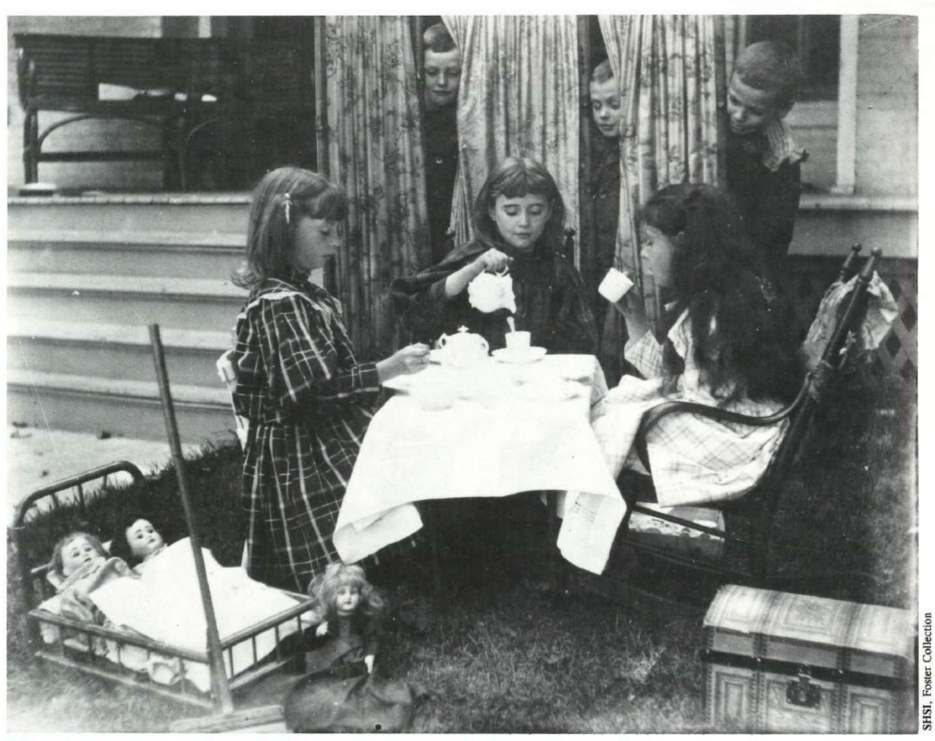
Three boys spy on an Iowa Falls tea party around the turn of the century.

players. In touch tag, the person touched becomes "it" and tries to touch another person. One version of tag is freeze tag. Players who have been touched must stand "frozen" until they are touched by another player. Kids also play TV tag, a version where a player is "safe" from the "it" person if they name a