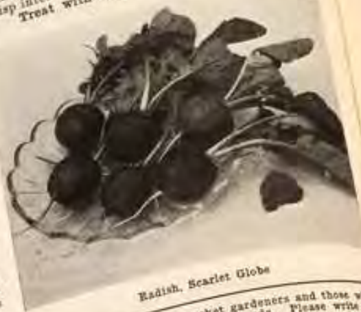
Radish, Scarlet Globe

Special prices given to market gardeners and those who use large quantities of garden seeds. Please write us if interested in quantity prices. Giving us a list of your requirements and special prices will be quoted to you by mail.