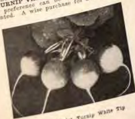
Radish, Scarlet Turnip White Tip