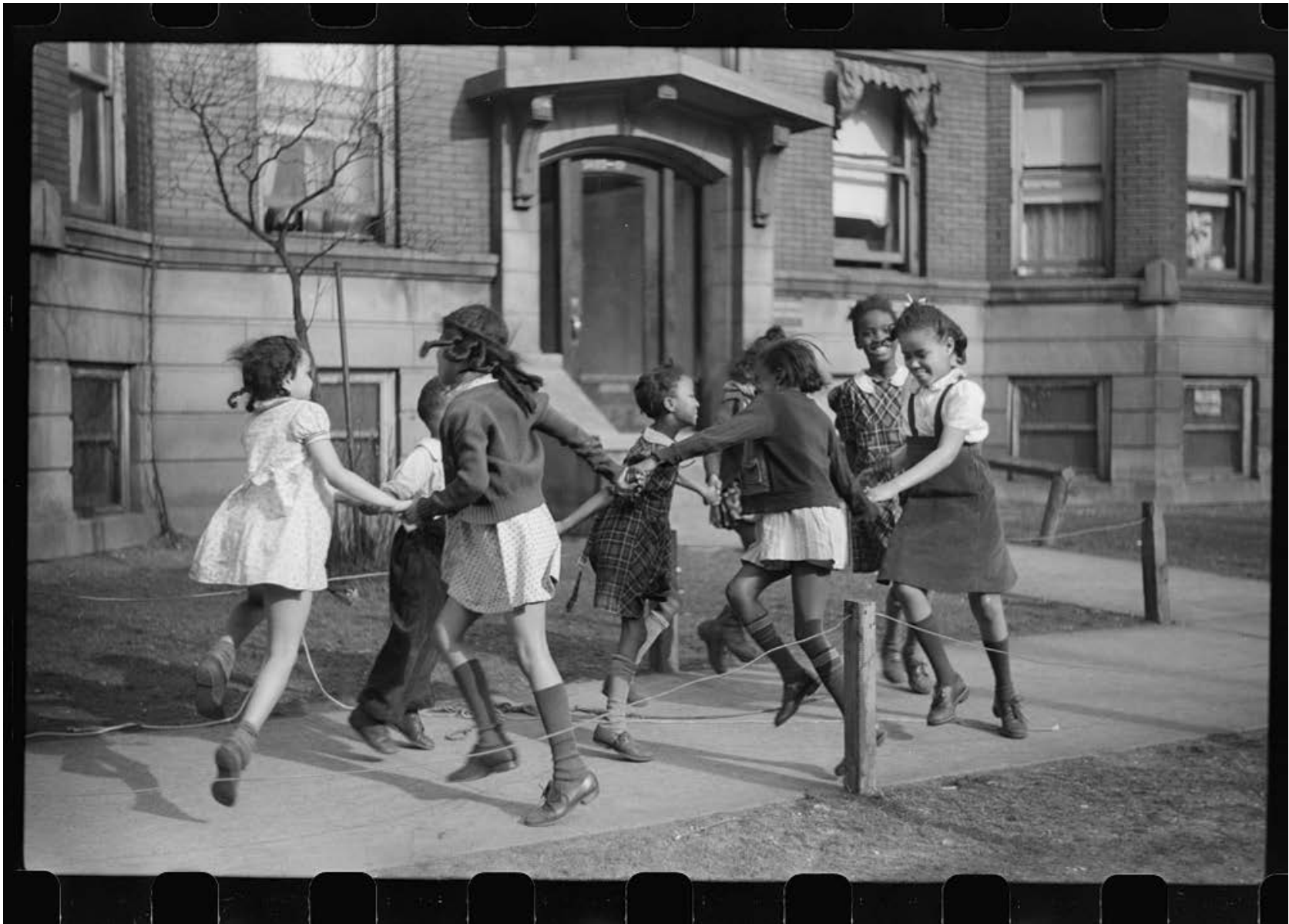
The children in this photo live in Chicago, Illinois. They are playing "ring around the rosie" on the sidewalk. The ring around the rosie game involves children forming a ring and dancing in a circle around a person. When they say the final line everyone stoops or curtsies. The slowest child to do so becomes the "rosie" and takes their place in the center of the ring. Courtesy of Library of Congress, Roskam, Edwin, "Children playing 'ring around a rosie' in one of the better neighborhoods of the Black Belt, Chicago, Illinois," April 1941