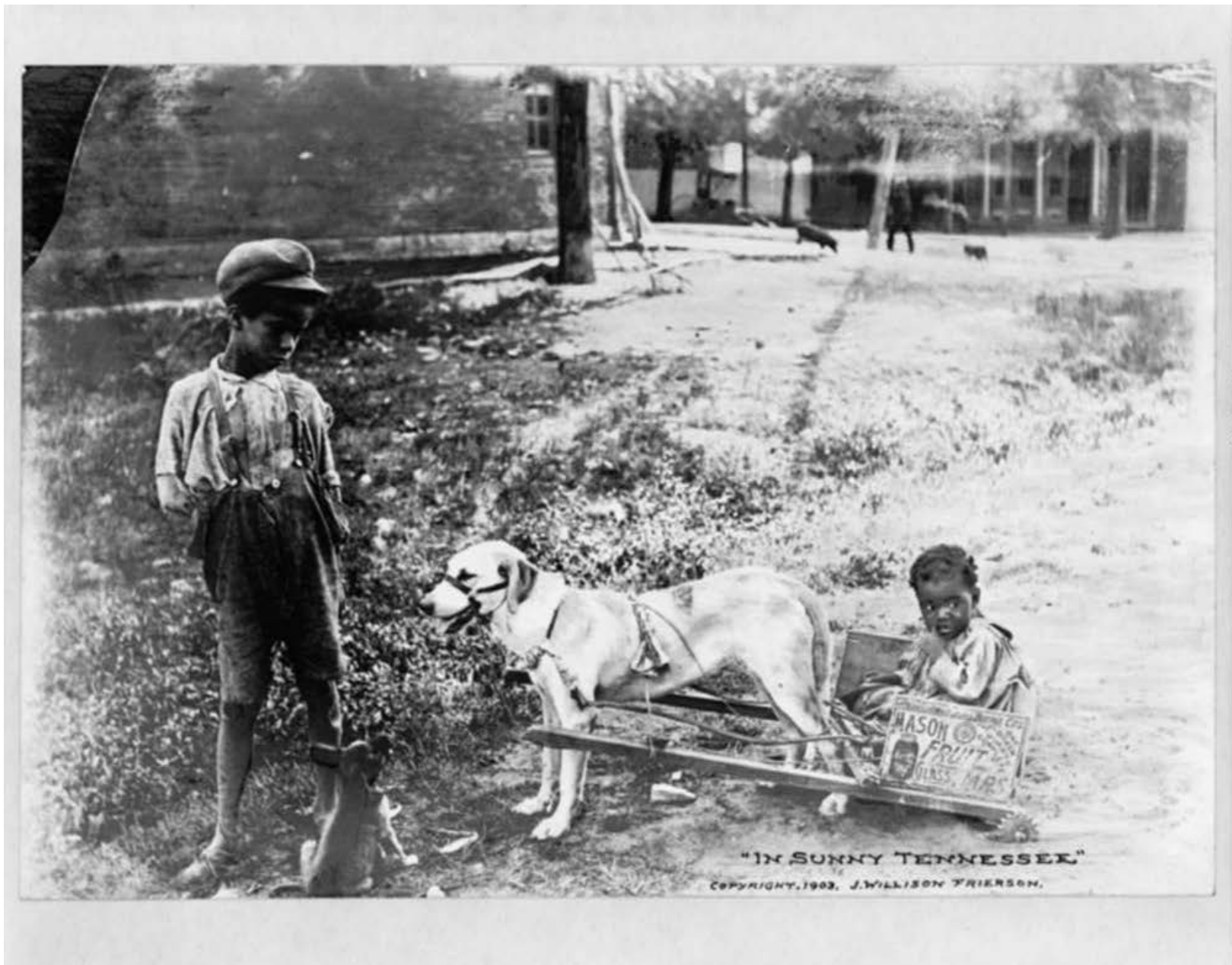
This photograph was taken in 1903 and shows two children playing in Tennessee. One of the children is being pulled in a cart by a dog. Courtesy of Library of Congress, "In Sunny Tennessee," ca. 1903