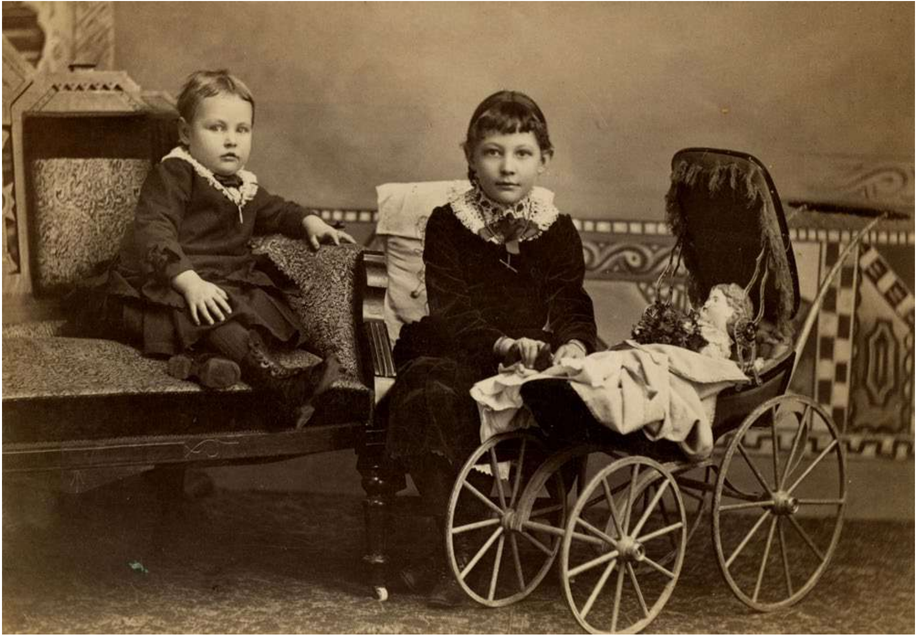
The portrait is of two young girls with doll, covered by a blanket, laying in their baby buggy. The photograph was taken in Shenandoah, Iowa, in 1890.