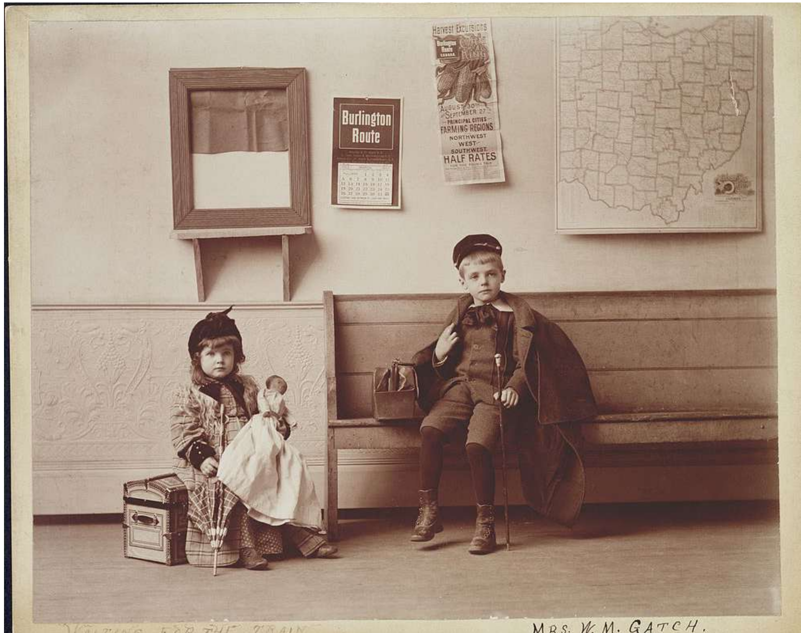
This 1893 photograph shows a boy and girl at a train station. The boy sits on a bench wearing a large cape, holding a walking stick, while the girl sits on a small trunk and holds a doll and parasol. Courtesy of Library of Congress, Gatch, W.M., "Waiting for the train," 30 June 1893