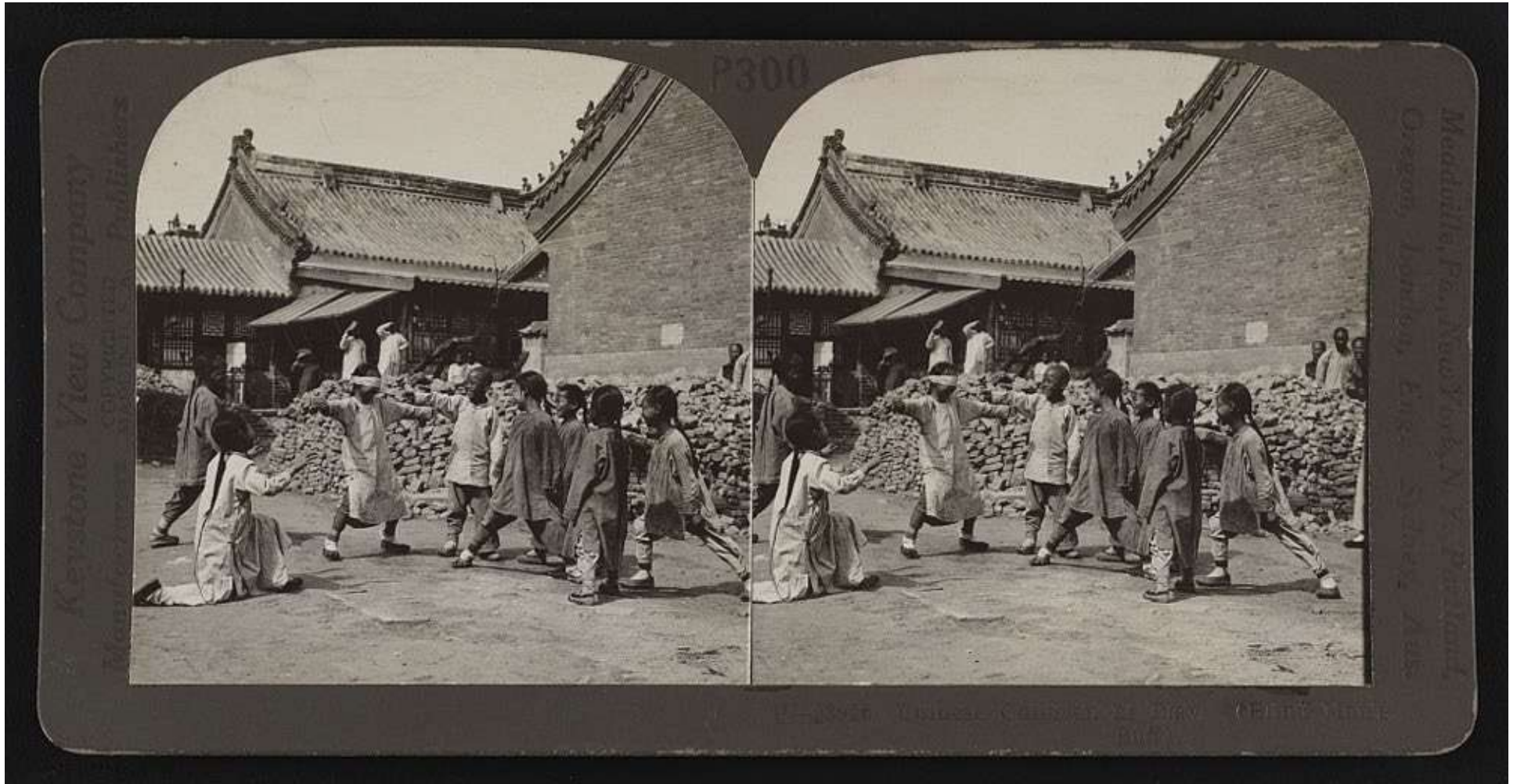
In this photo, taken in Beijing, China, the children are playing "blind man's bluff" which is like the game of tag. In blind man's bluff, the child who is "it" is blindfolded and has to find and tag the other players. Once a player is tagged as it, they have to put on the blindfold.