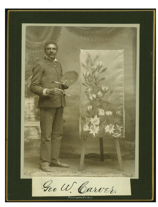
Charles Aldrich Autograph Collection, State Historical Society of Iowa, Des Moines.